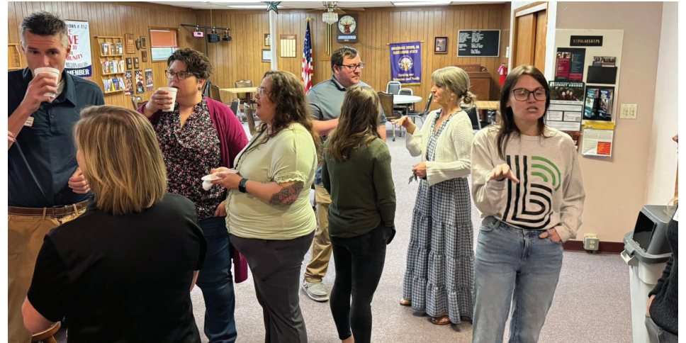
May 2026 Caffeinated Conversations hosted by the Marshalltown Elks Lodge & Heart of Iowa Big Brothers Big Sisters