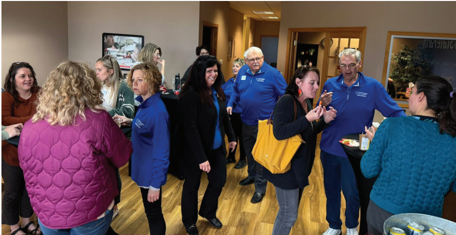
April 2026 Business After Hours at the Stahlin Agency-State Farm