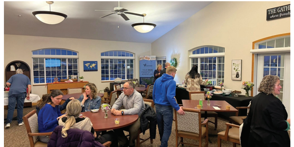
January 2026 Business After Hours at Glenwood Place