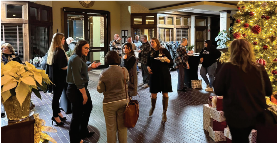
December 2025 Business After Hours at Pinnacle Bank