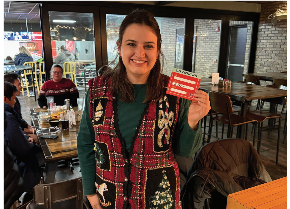
December 2025 Connect Marshalltown Ugly Sweater Party at Wayward Social