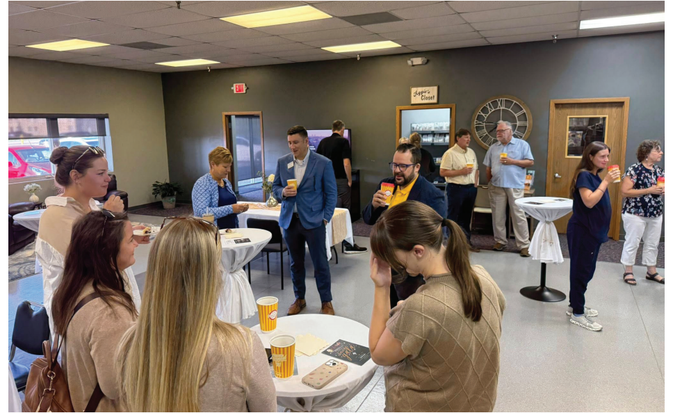
August 2025 Caffeinated Conversations at Guiding Star Marshalltown