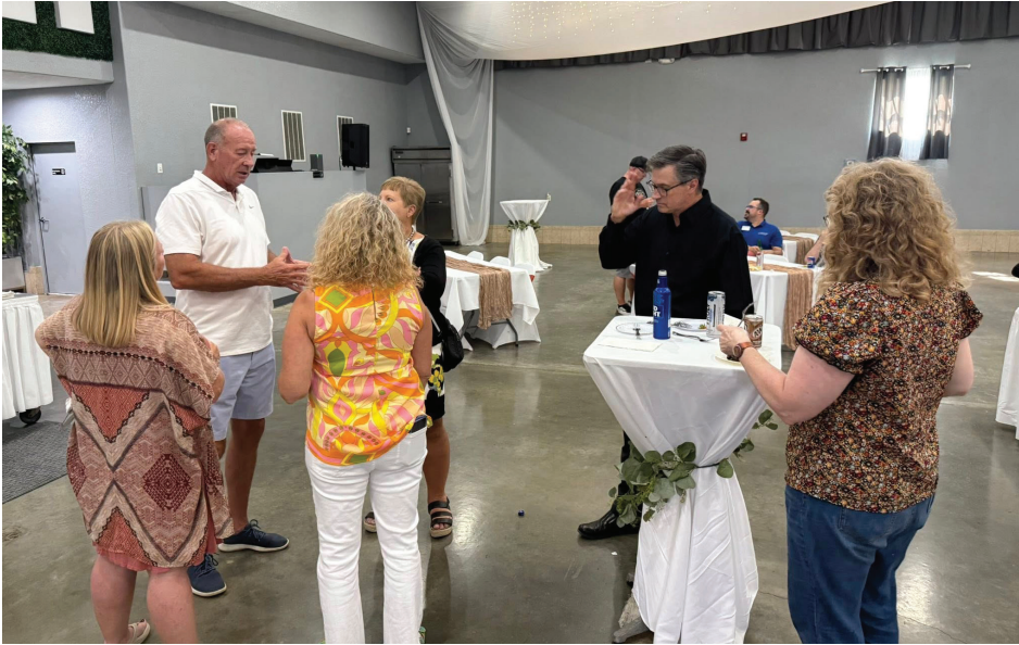
August 2025 Business After Hours at Midnight Garden