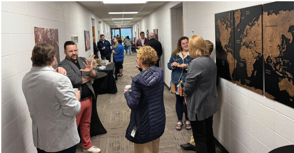
March 2025 Caffeinated Conversations at Child, Adolescent, and Parent Support (CAPS)