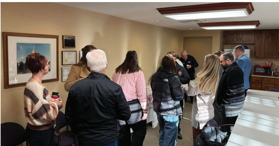
April 2025 Caffeinated Conversations at Iowa River Hospice