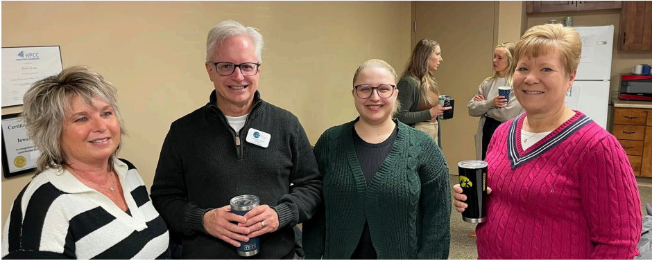
March 27, 2024 Caffeinated Conversations at Iowa River Hospice