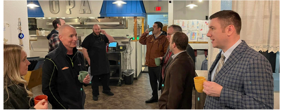
April 2, 2024 Caffeinated Conversations at OPA Grill