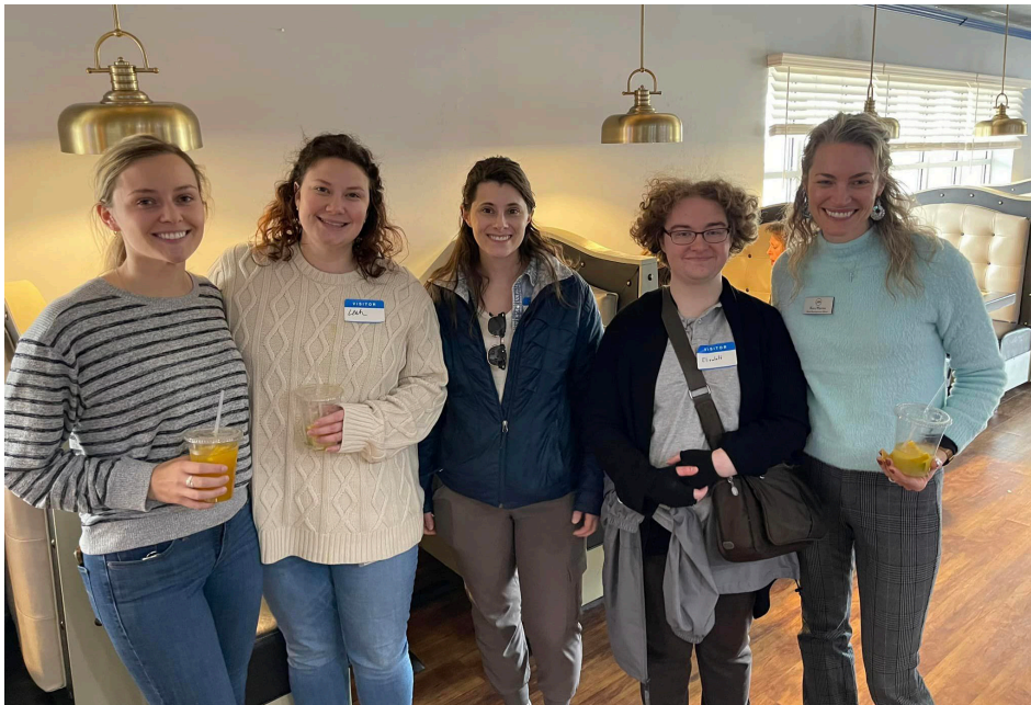
Connect Marshalltown was at Mojitos Bar & Grill on April 3, 2024.