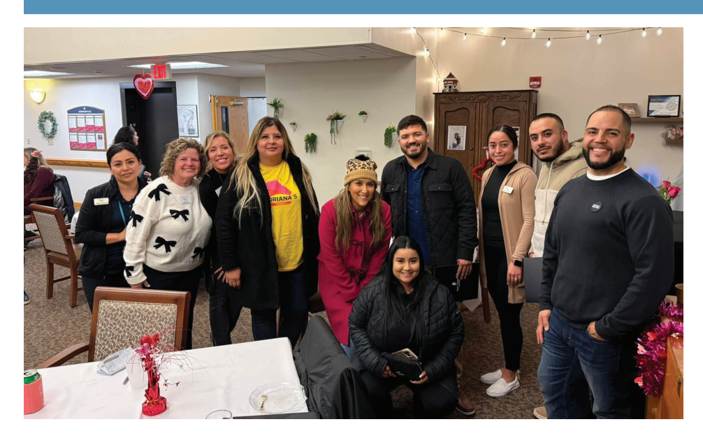
Business After Hours - Glenwood Place January 2025