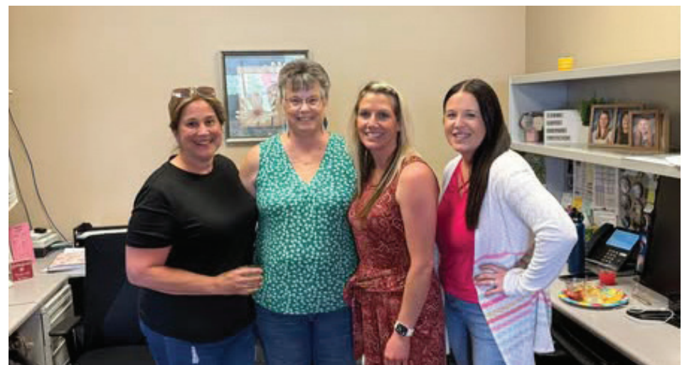
May 2025 Business After Hours at Marshall County Abstract

If you or a loved one is recovering from an illness or injury, or requires assistance for chronic impairments, the home health team is ready to help! Services include skilled nursing visits, physical therapy, occupational therapy, speech therapy, medical social work support, and bath aide services.