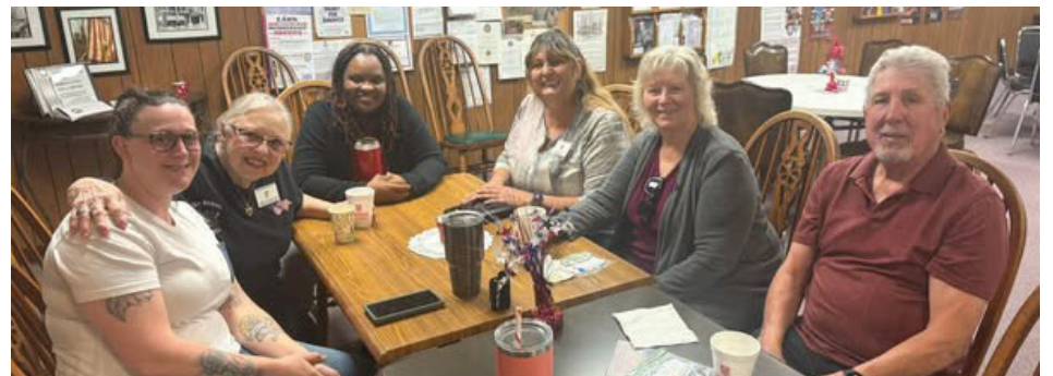
May 2025 Caffeinated Conversations hosted by the Marshalltown Elks Lodge #312 & Heart of Iowa Big Brothers Big Sisters