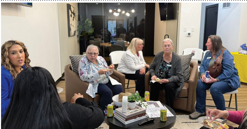
April 2025 Business After Hours at Adriana's Agency 2