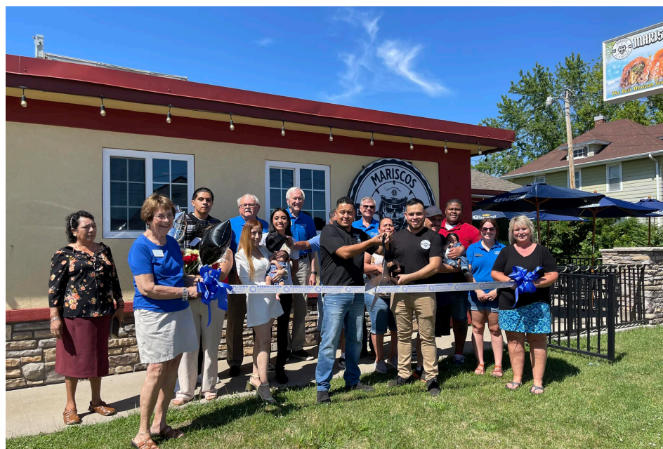
The Chamber Ambassadors held a ribbon cutting on Friday, June 14 for Mariscos El Capitan 2.0 ! Stop out for delicious food and drinks and welcome this new business to Marshalltown!