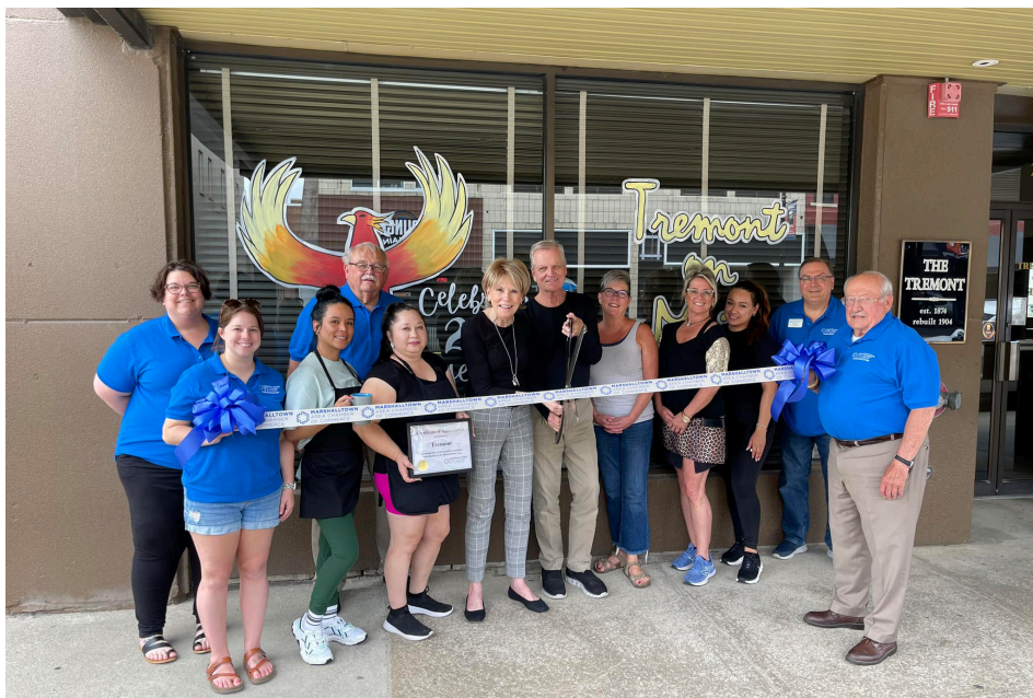
The Tremont celebrated 25 years in business on June 3rd! Congratulations!