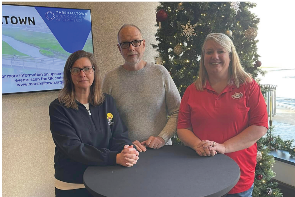
December Caffeinated Conversations at the Chamber hosted by Scooter's Coffee