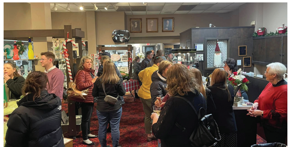
November Business After Hours at Hellberg's Jewelers