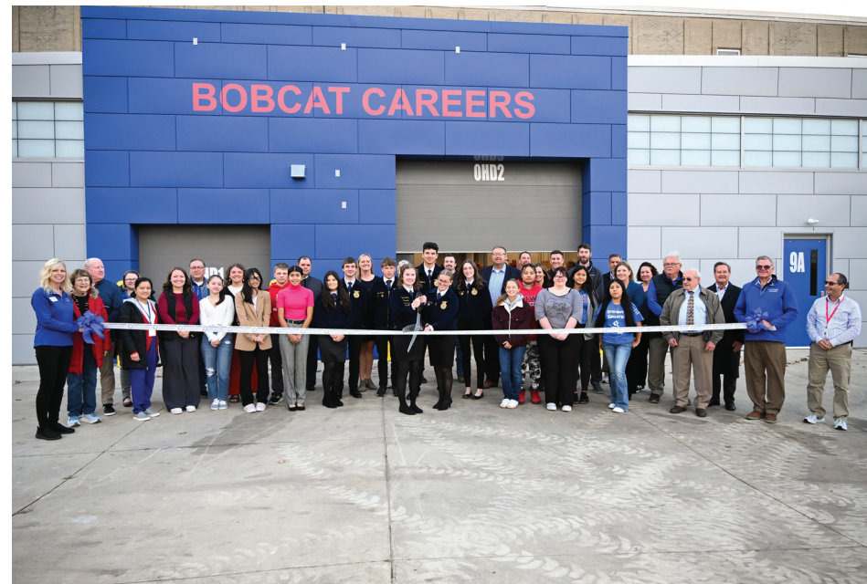
The Chamber Ambassadors helped Marshalltown High School celebrate the new Career Technical Education (CTE) addition and science classroom upgrades on October 31.

Visit www.marshalltown.org for all the latest Chamber news and upcoming events.