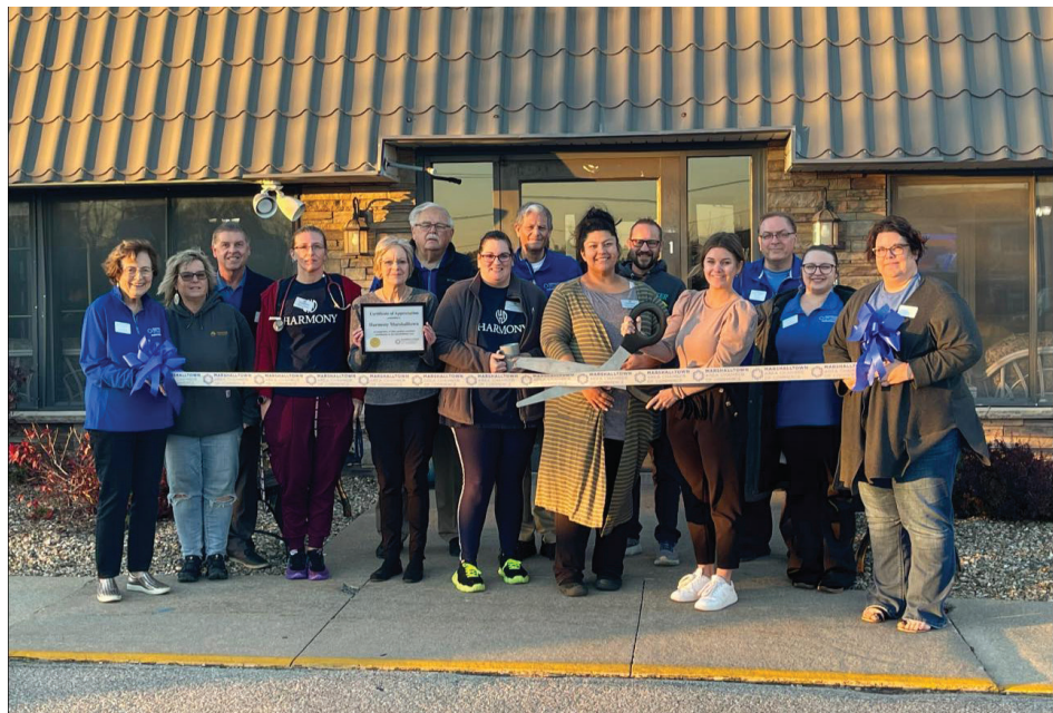
The Chamber Ambassadors held a ribbon cutting for Harmony Marshalltown , formerly Grandview Heights, to celebrate the name change. Congratulations!