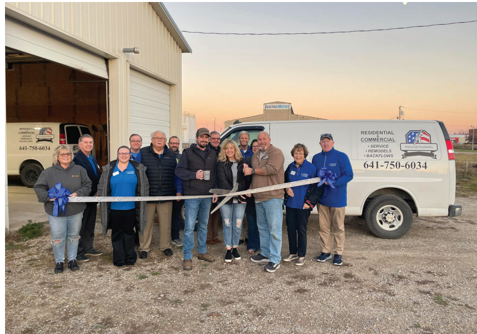
On November 12 we celebrated Williams Plumbing with a ribbon cutting at their new shop. Williams Plumbing specializes in commercial and residential service, remodels, and backflows.