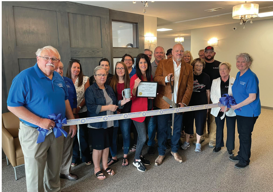
The Chamber Ambassadors held a ribbon cutting for Clock Tower Senior Apartments located at 403 E. Church Street!