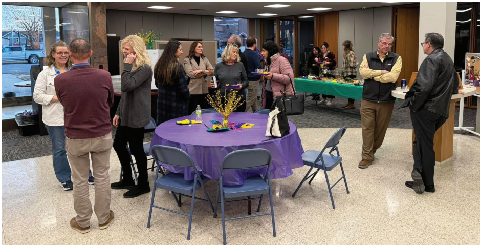
Business After Hours - Alerus February 2025