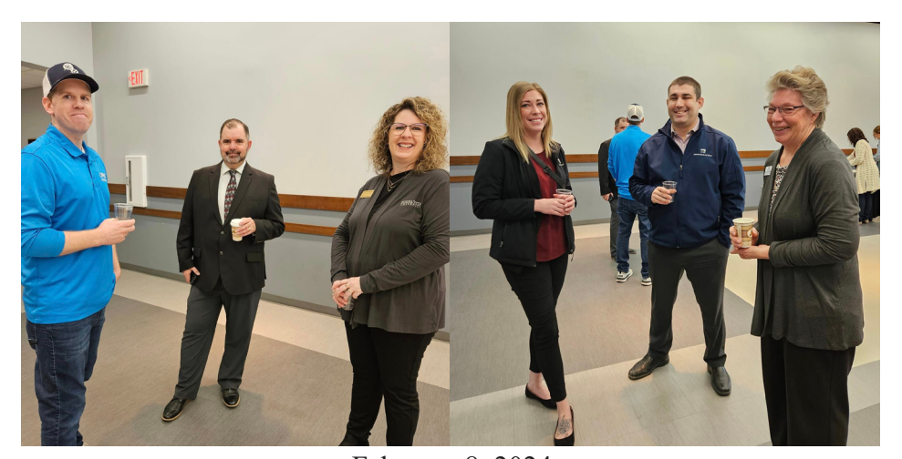
February 8, 2024 Caffeinated Conversations hosted by Iowa Valley Community College District