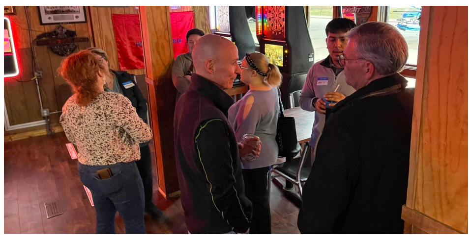
February 7, 2024 Connect Marshalltown at the Old Timer Tavern