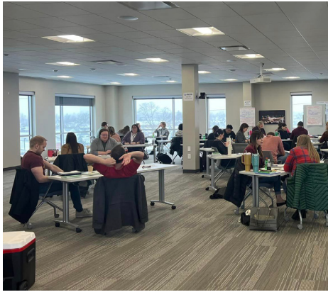
January Session at RACOM Corporation