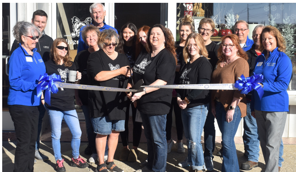
Oliver Beene Designs (214 E. Main Street) made it to their final destination on November 18, 2023. The celebrated the Grand Re-Opening with a ribbon cutting.