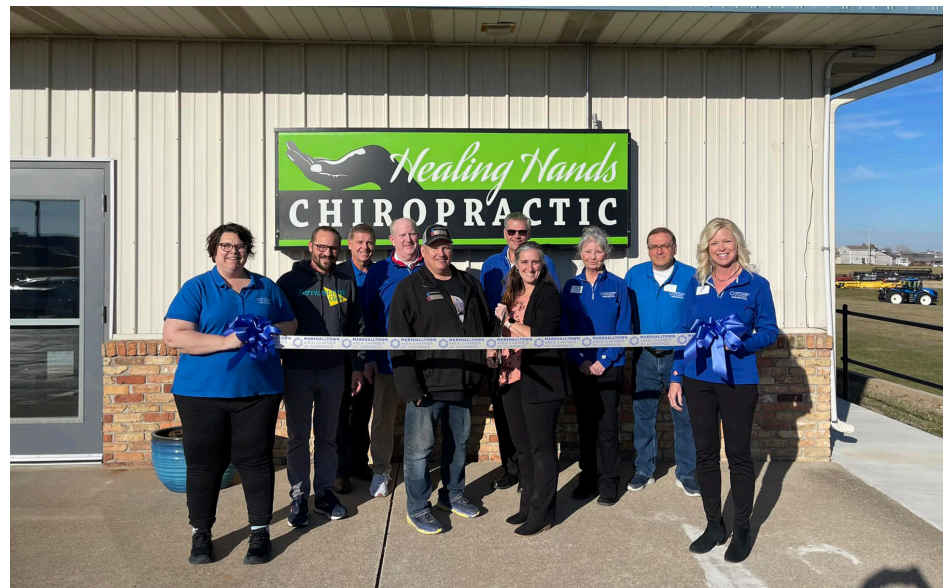
On December 7, 2023 we celebrated the new location of Healing Hands Chiropractic (507 Iowa Ave W, Suite C) with a ribbon cutting.

To view images from past ribbon cuttings & courtesy calls visit our website at www.marshalltown.org/ribbon-cuttings-courtesy-calls