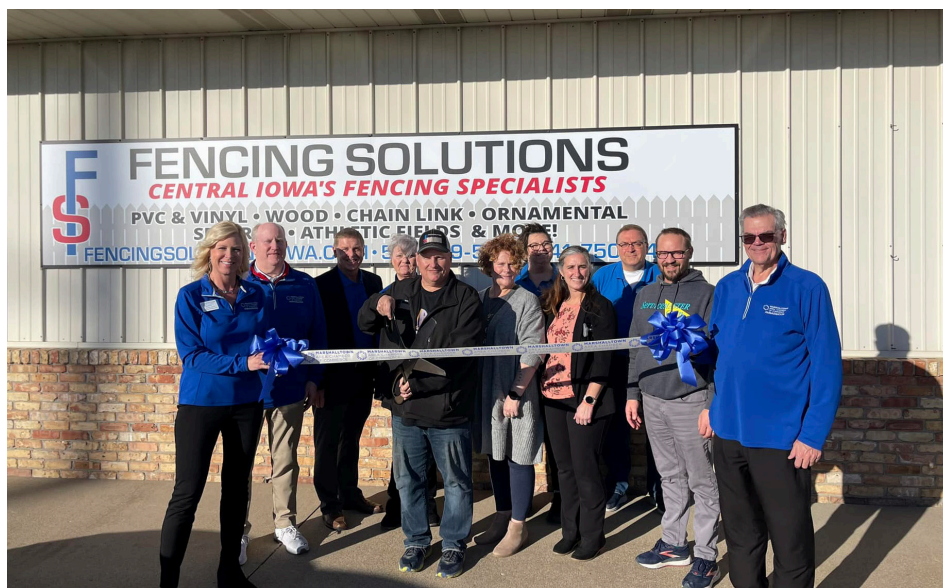
The Chamber Ambassadors helped Chamber member Fencing Solutions (507 Iowa Ave W, Suite A) celebrate their new location with a ribbon cutting on December 7, 2023.