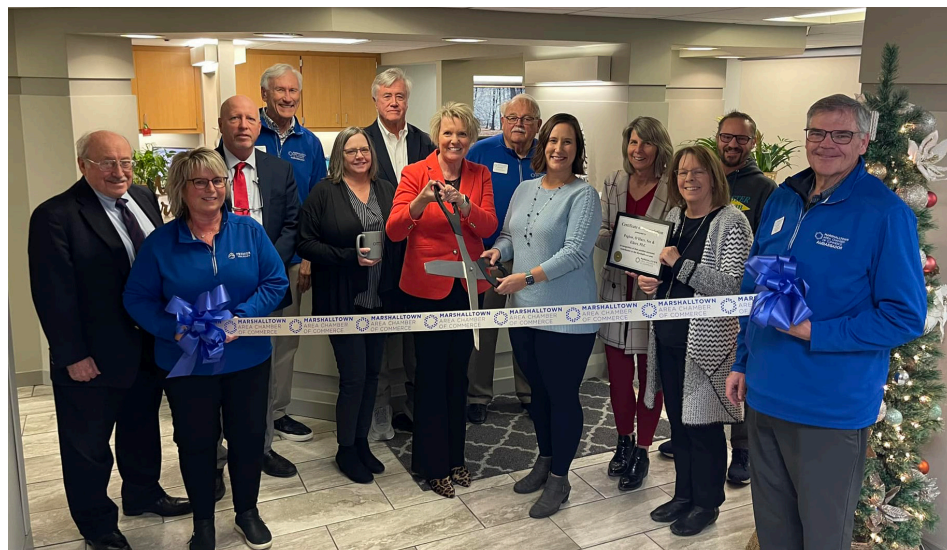
On Tuesday, November 28 the Chamber Ambassadors held a ribbon cutting at the new office location of Peglow, O'Hare, See & Eilers PLC (112 E. Linn Street).