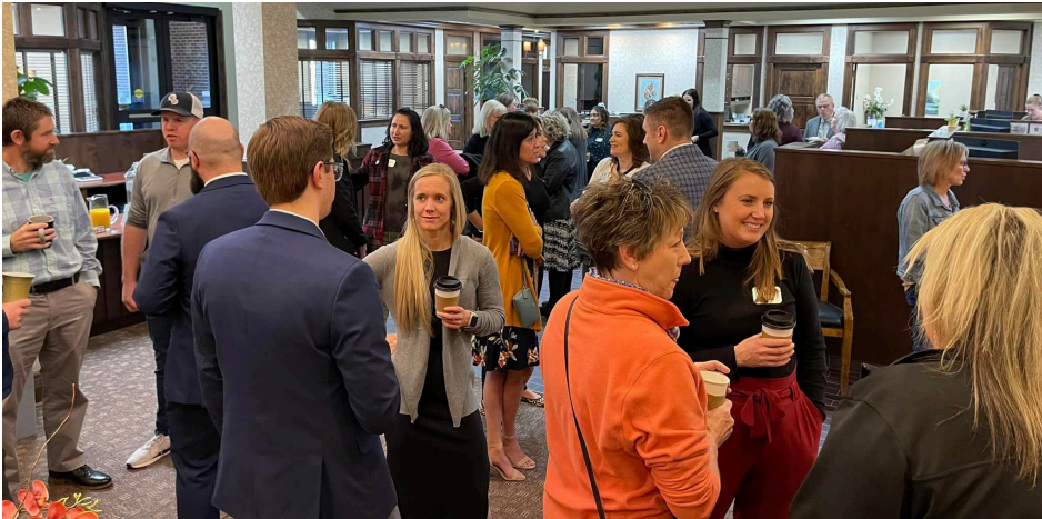
November 14, 2023 Caffeinated Conversations hosted by Pinnacle Bank