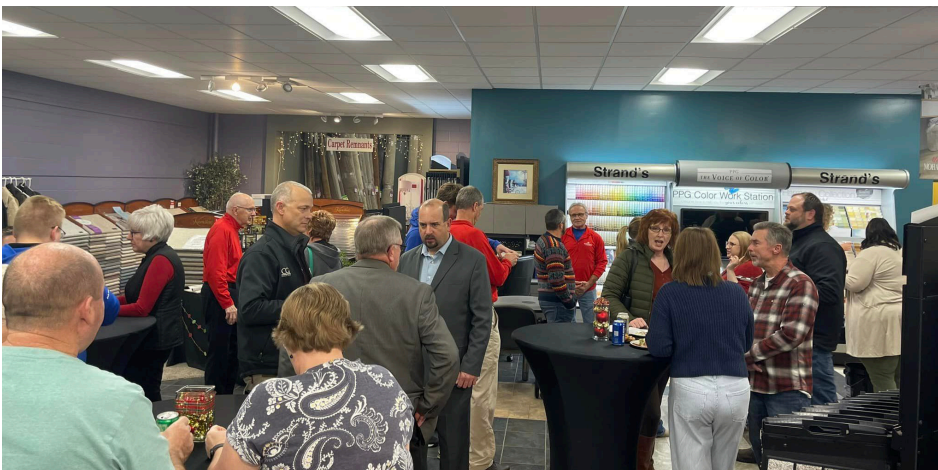
December 6, 2023 Business After Hours hosted by Strand's Flooring & Paint