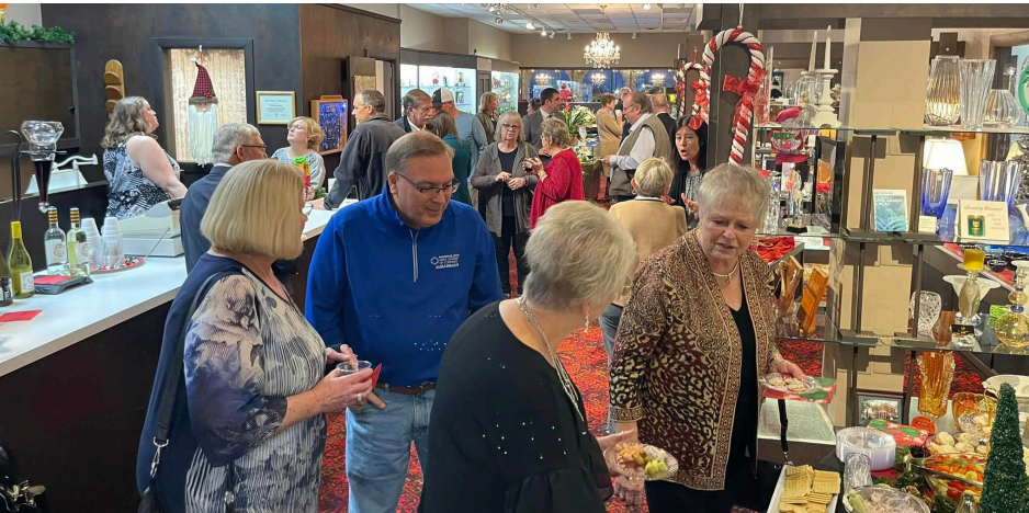
November 16, 2023 Business After Hours hosted by Hellberg's Jewelers