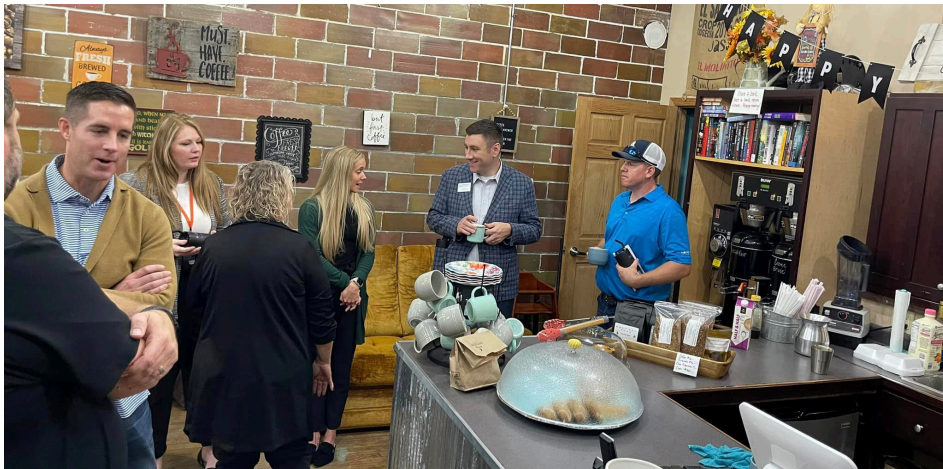
October 25, 2023 Caffeinated Conversations hosted by Accura Healthcare of Marshalltown