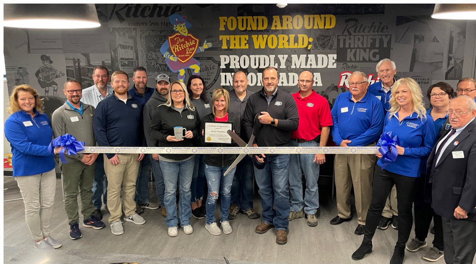
Congratulations to Ritchie Industries as they recently completed renovations to their office space and facade! On November 7, 2023 the Chamber Ambassadors helped Ritchie Industries celebrate with a ribbon cutting. We also received a tour of their facility learning how their automatic waterers are made.