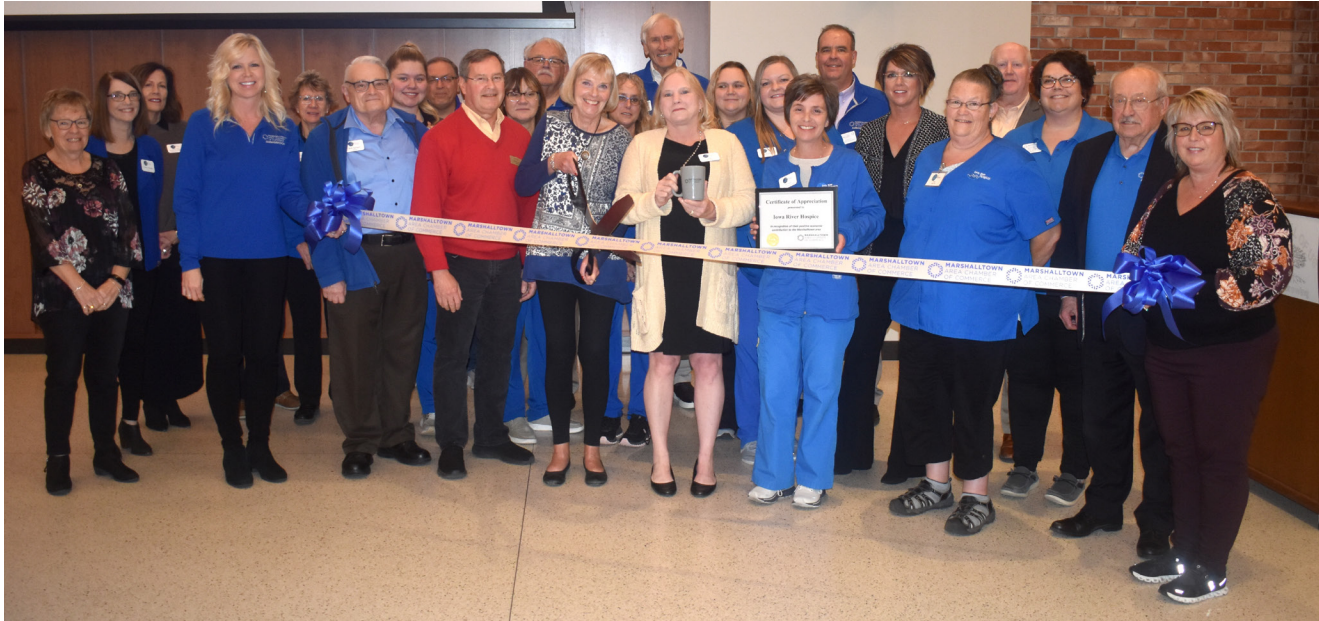
On November 9, 2023 Iowa River Hospice celebrated their 40 year anniversary with a ribbon cutting and open house!