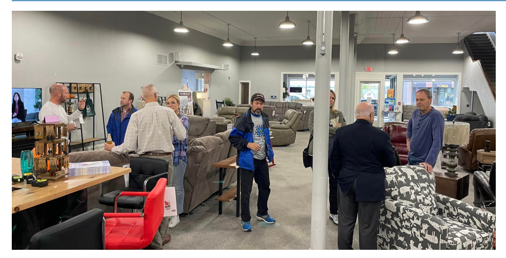
October 19, 2023 Business After Hours at McGregors Furniture & Mattress