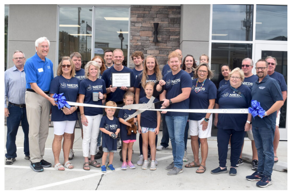
Nied's Pharmacy (211 W. Main Street) opened late September 2023. The Chamber Ambassadors held a ribbon cutting for the new business.

To view images from past ribbon cuttings & courtesy calls visit our website at www.marshalltown.org/ribbon-cuttings-courtesy-calls