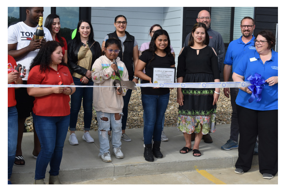
The Chamber Ambassadors helped JBS (1804 S. 7th Ave) celebrate the opening of their new housing units with a ribbon cutting.