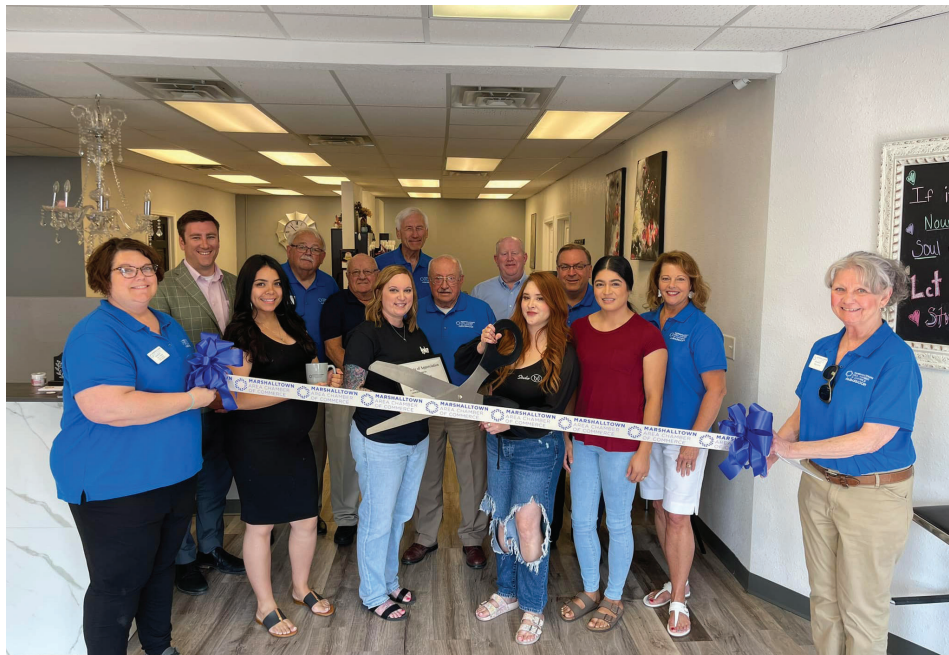
A ribbon cutting was held on June 27, 2023 for new Chamber member Studio M! Congrats and welcome to the Chamber!