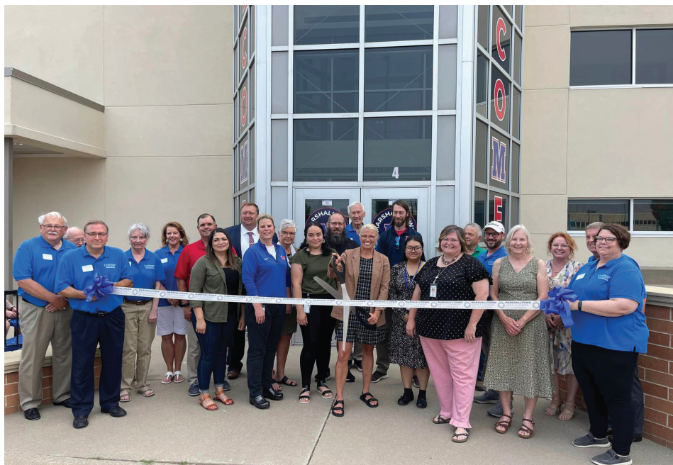
On June 27, 2023 the Marshalltown Community School District celebrated their new Welcome Center at the Orpheum Theater with a ribbon cutting and open house! Such a great addition to Marshalltown!