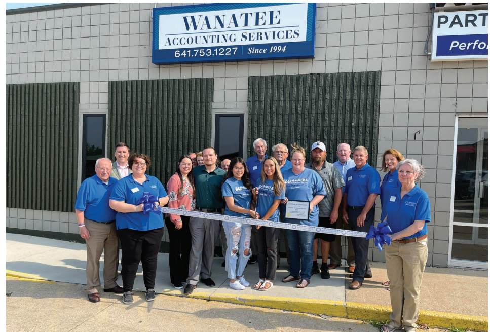
The Chamber Ambassadors held a ribbon cutting for new Chamber member Wanatee Accounting Services LLC on June 27, 2023! Wanatee has been in business for nearly 30 years, welcome to the Chamber!