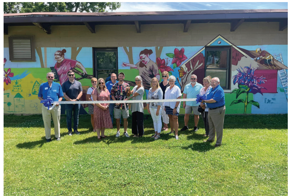
The Arts + Culture Alliance celebrated the Neighborhood Mural Project at Anson Park on June 30, 2023 with a ribbon cutting! Such a beautiful addition to our community!

Visit www.marshalltown.org for all the latest Chamber news and upcoming events.