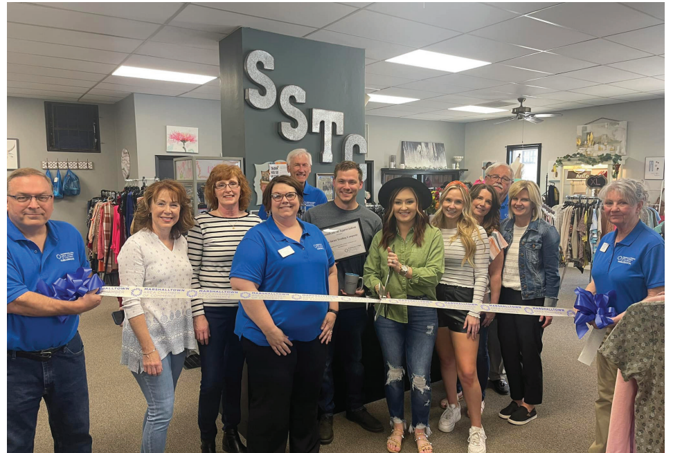
May 4, 2023 a ribbon cutting was held at State Street Trading Company to celebrate 5 years in business! Congrats!