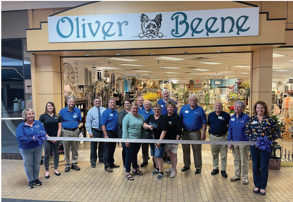
The Chamber Ambassadors held a ribbon cutting on April 25, 2023 for Oliver Beene Designs to celebrate their new location in the Marshalltown Mall!