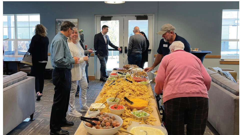
Business After Hours-April 26, 2023 at The Willows