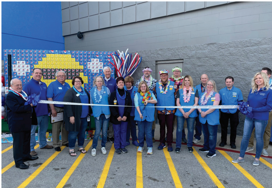
May 5, 2023 the Chamber Ambassadors held a ribbon cutting with the Marshalltown Walmart celebrating their grand re-opening! They have recently completed renovations and updates to the location.