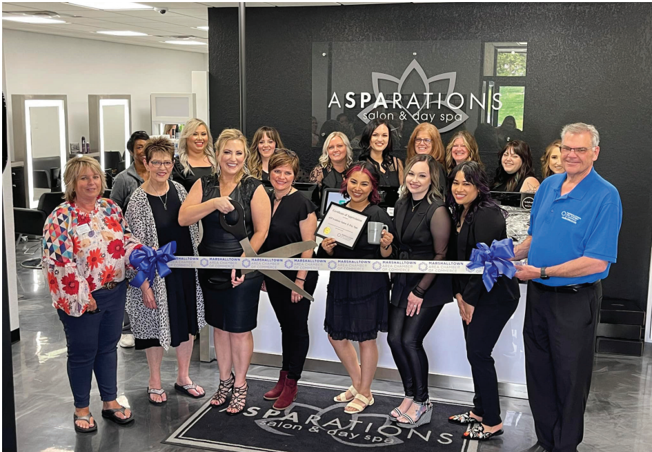
Congrats to aSPArations Salon and Day Spa for celebrating 10 years in business! The Chamber Ambassadors held a ribbon cutting on May 11, 2023.