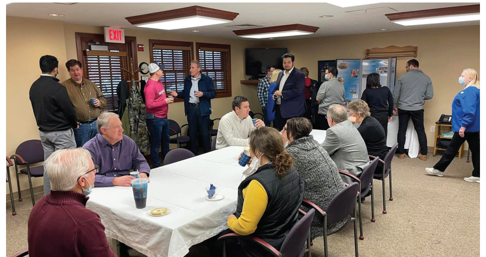
Caffeinated Conversations-March 8, 2023 at Iowa River Hospice

Chamber Bucks are great gifts and a perfect way to THINK LOCAL FIRST!