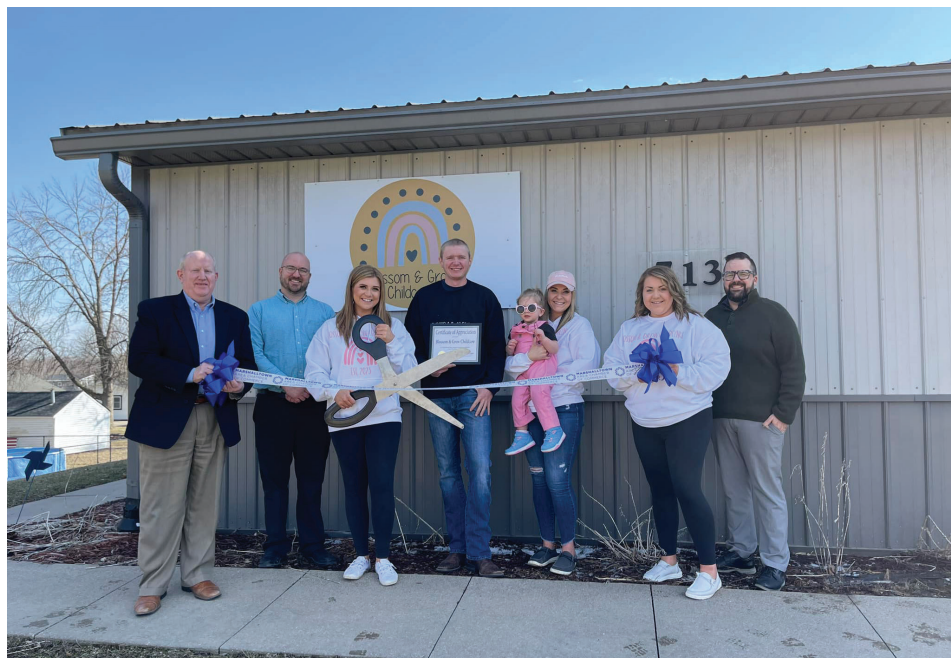
The Chamber Ambassadors held a ribbon cutting on March 20, 2023 as part of the open house for Blossom & Grow Childcare at 713 S. 12th Street in Marshalltown.