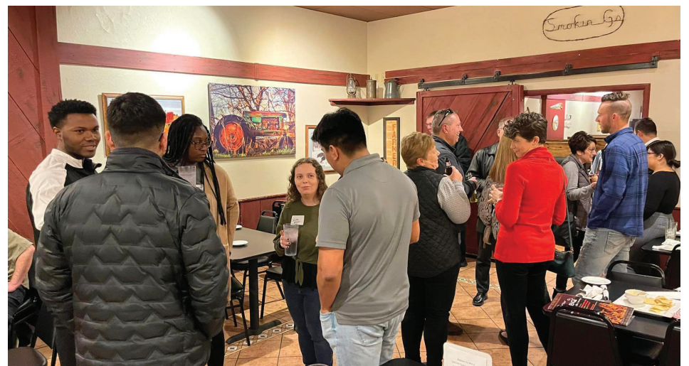
Connect Marshalltown-March 1, 2023 at Smokin' G's BBQ