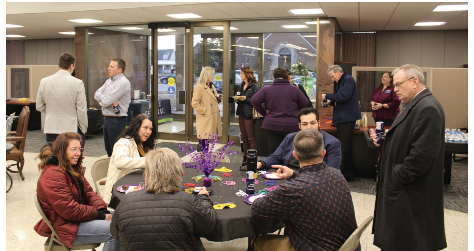
Business After Hours-February 21, 2023 at Home Federal Savings Bank