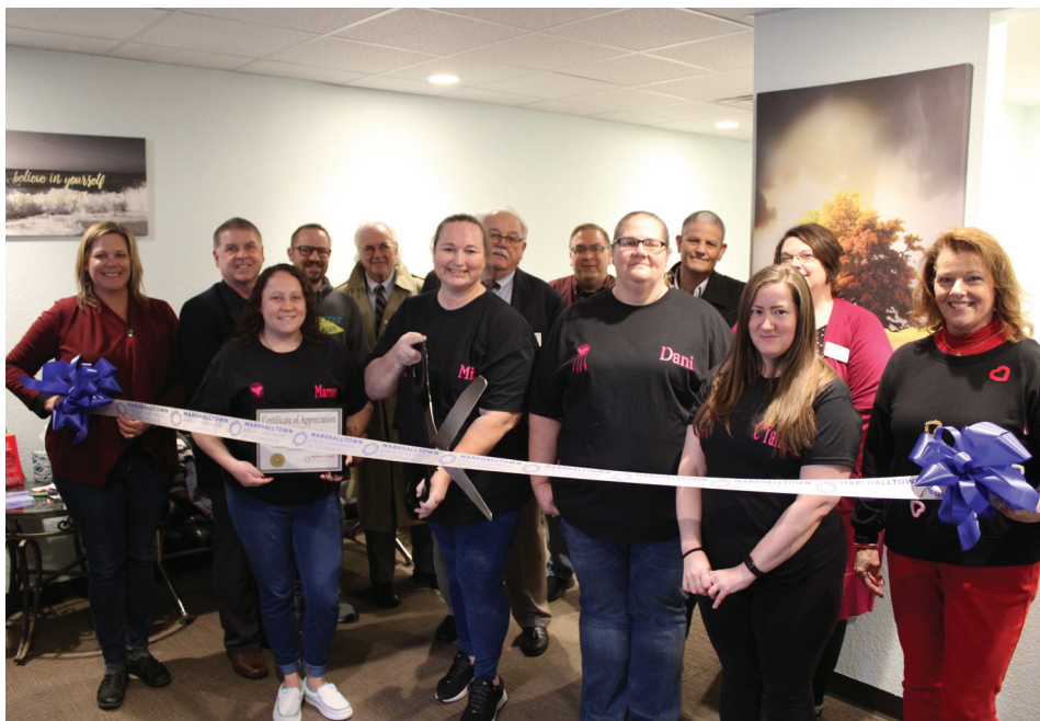
The Chamber Ambassadors held a ribbon cutting on February 14, 2023 as part of the open house for Wild Spirit Counseling at 15 East Southridge Road.