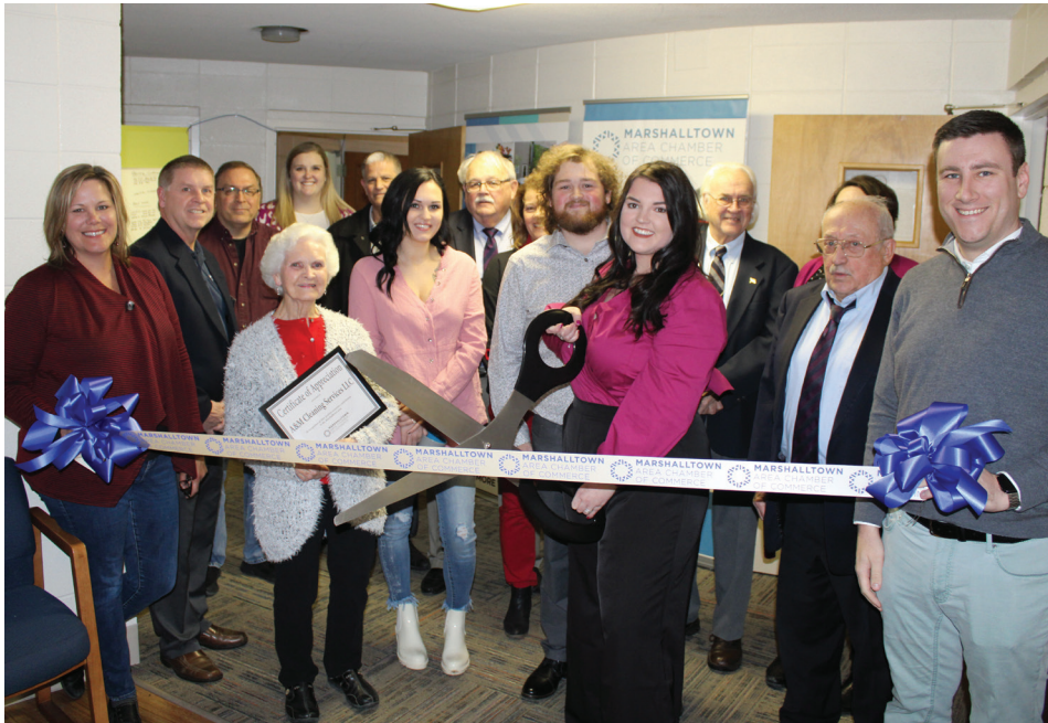
The Chamber Ambassadors hosted a ribbon cutting on February 14, 2023 for new Chamber member A&M Cleaning Services LLC .