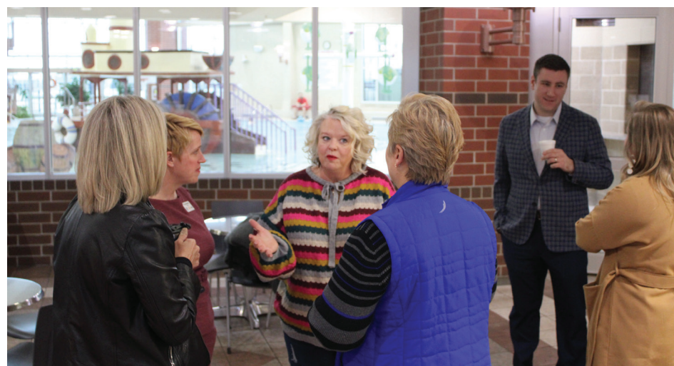
Caffeinated Conversations-February 15, 2023 at the Marshalltown YMCA-YWCA

Chamber Bucks are great way to THINK LOCAL FIRST!