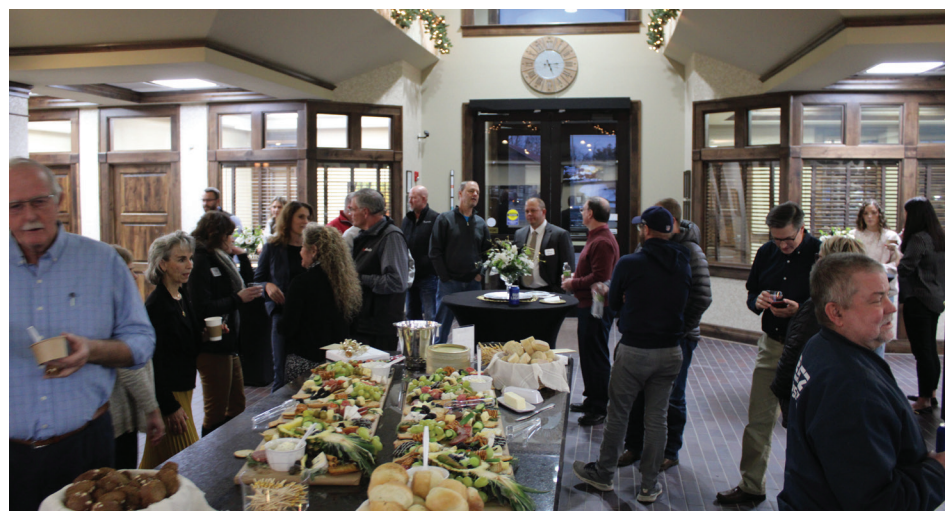
Business After Hours-January 12, 2023 at Pinnacle Bank