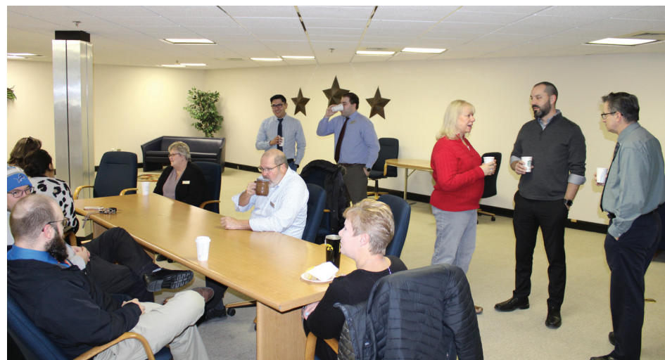
Caffeinated Conversations-January 10, 2023 at US Bank

Wanatee Accounting has been providing clients in the central Iowa area with first-class accounting services since 1994. Wanatee Accounting will take care of all of your financial needs so you don't have to, leaving you free to focus on the rest of your life.