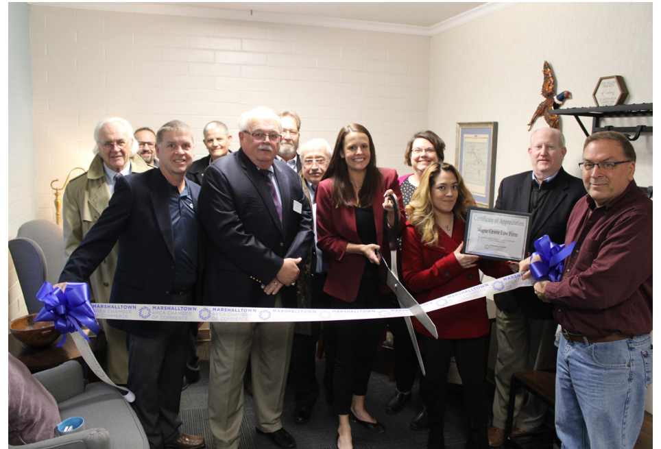
The Chamber Ambassadors visited new Marshalltown business Maple Grove Law Firm at 309 W. Main Street for a ribbon cutting on February 14, 2023.