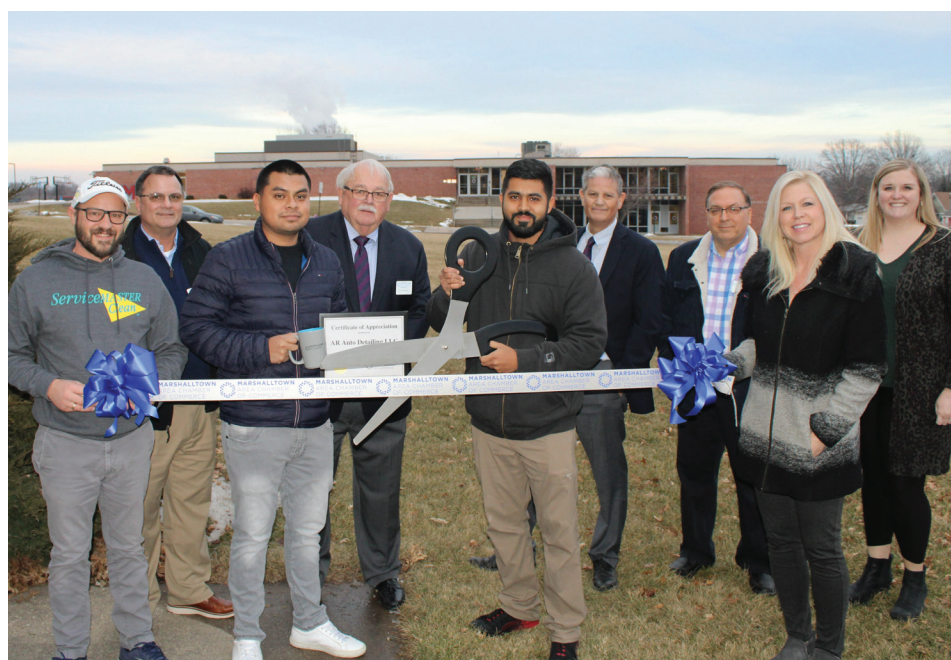
The Chamber Ambassadors held a ribbon cutting on January 10, 2023 for AR Auto Detailing LLC .

Visit www.marshalltown.org for all the latest Chamber news and upcoming events.