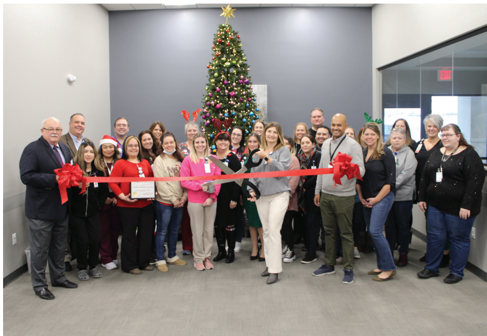
The Chamber Ambassadors held a ribbon cutting to celebrate the new location of Primary Health Care on December 20, 2022.