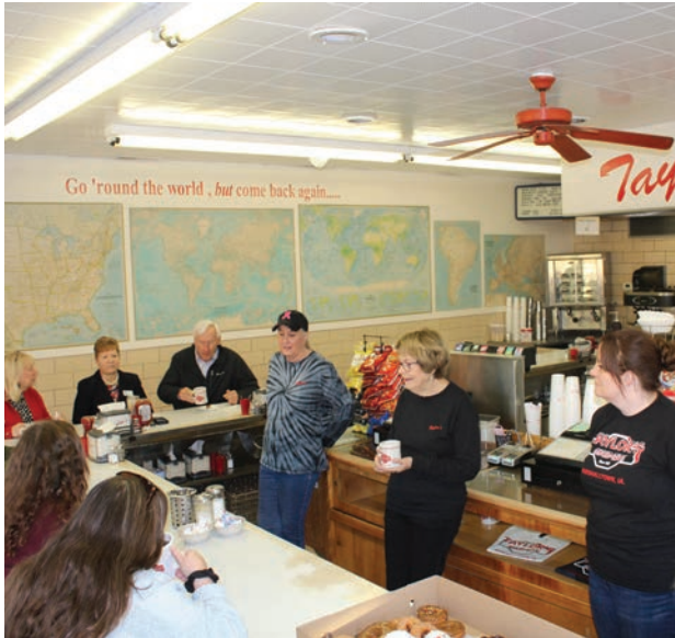
Caffeinated Conversations November Taylor's Maid-Rite