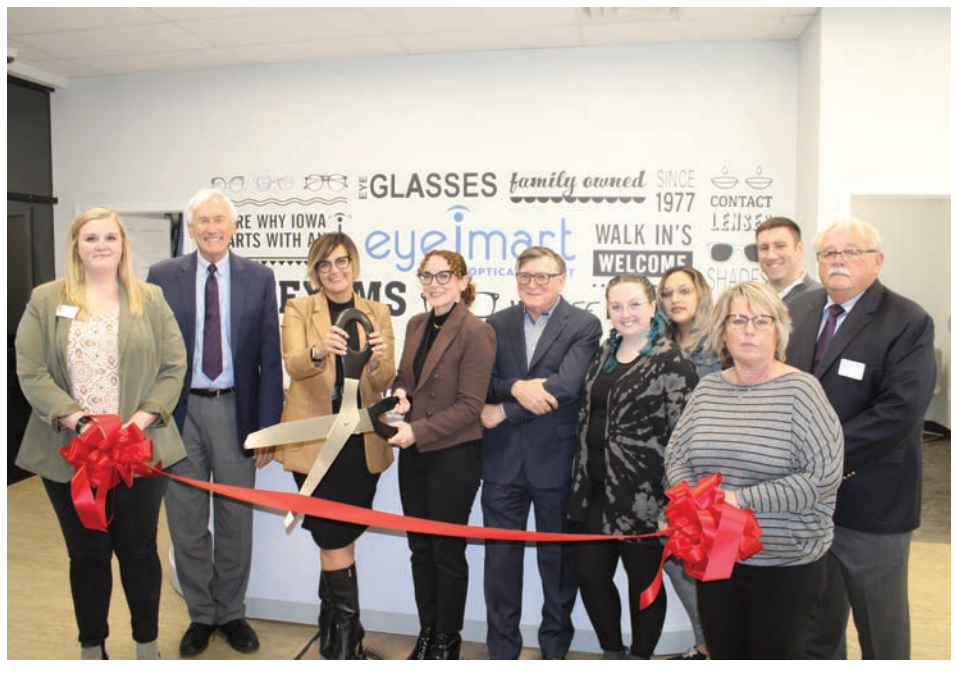
The Chamber Ambassadors held a ribbon cutting to celebrate the opening of Eyemart Optical Outlet on November 29, 2022.