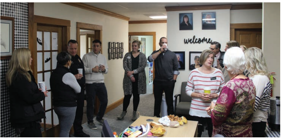
Caffeinated Conversations October Heart of Iowa Big Brothers Big Sisters