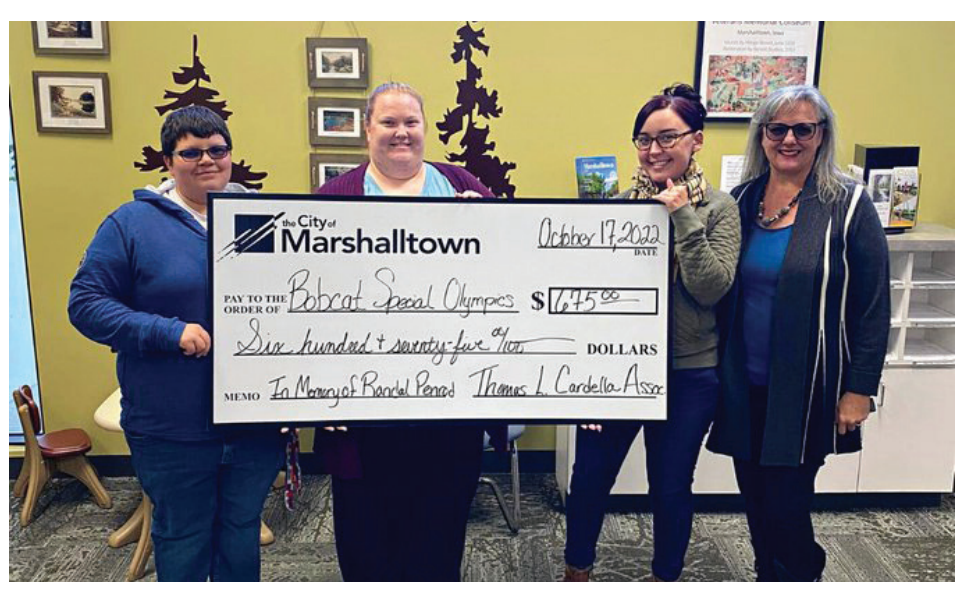
The TLC Associates Marshalltown team made a recent donation of $675 to Bobcat Special Olympics to support local athletes in upcoming events.