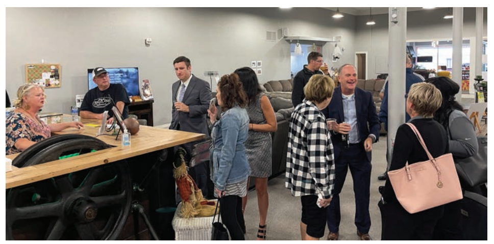
Business After Hours October McGregors Furniture & Mattress