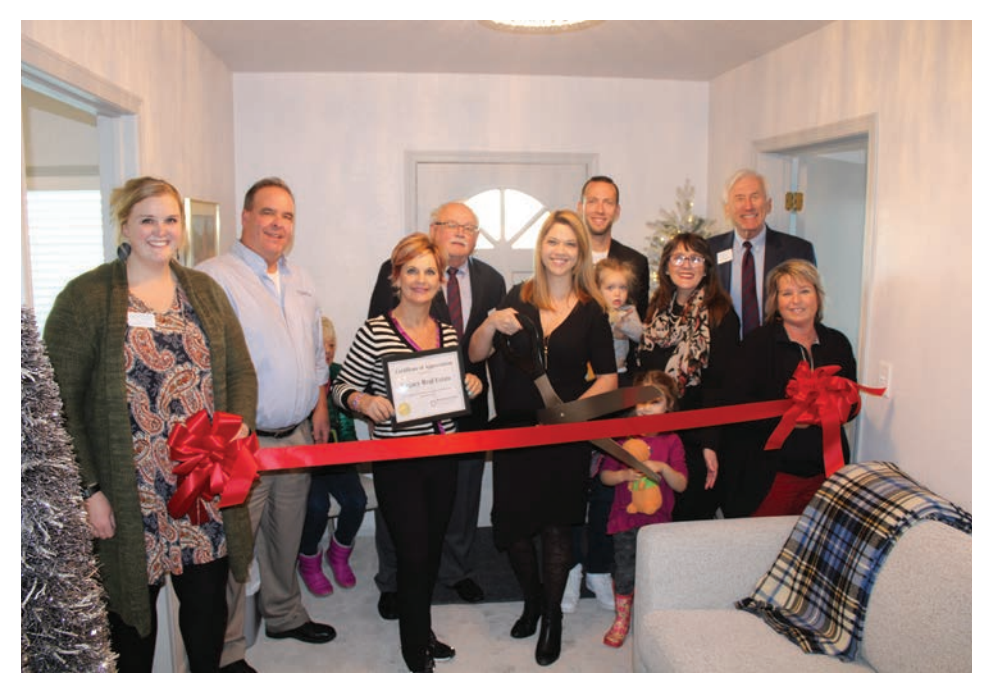
The Chamber Ambassadors celebrated the opening of the new location of Legacy Real Estate on December 1, 2022.