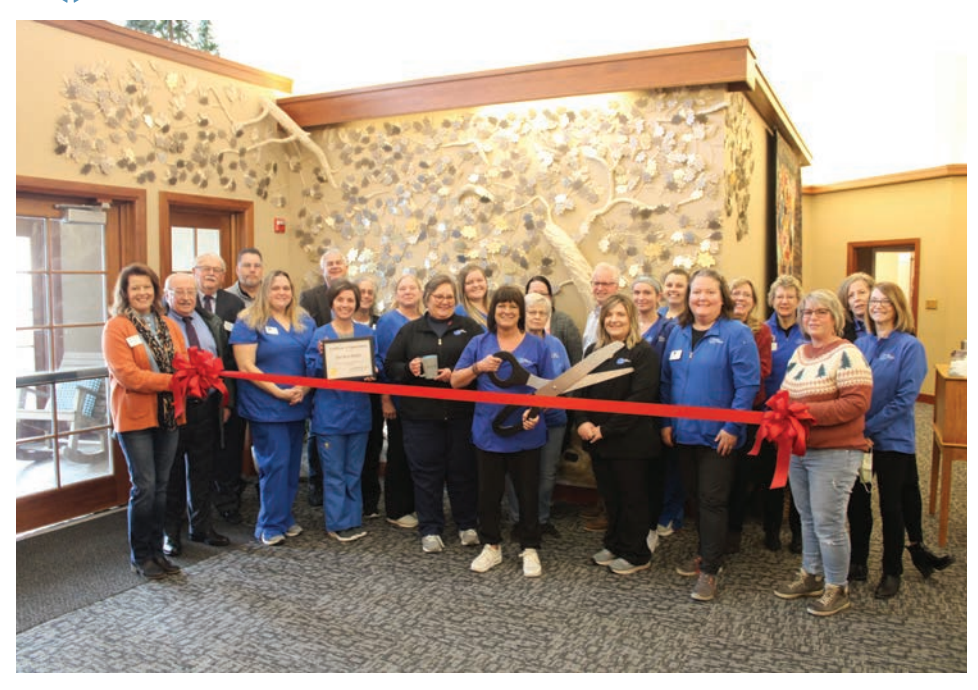
The Chamber Ambassadors held a ribbon cutting at Iowa River Hospice on November 17, 2022 to celebrate National Hospice Month.