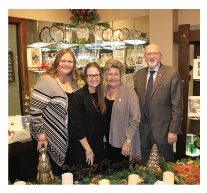
Business After Hours November Hellberg's Jewelers