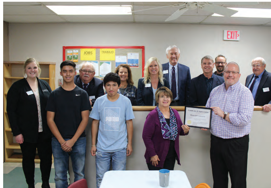
The Chamber Ambassadors made a courtesy call stop at the House of Compassion on November 8, 2022.