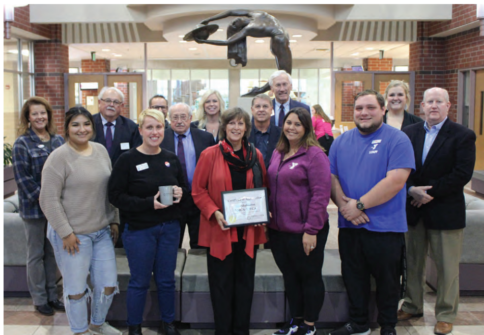
The Chamber Ambassadors stopped by the Marshalltown YMCA-YWCA for a courtesy call on November 8, 2022.