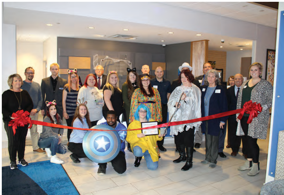
The Chamber Ambassadors joined in the celebration of the reopening of the Holiday Inn Express on October 25, 2022.