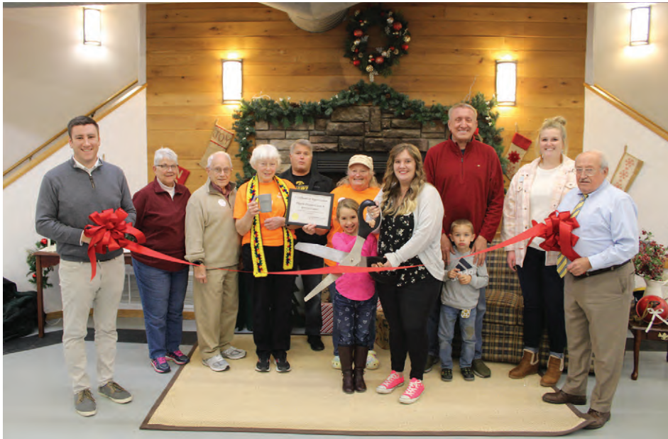
A ribbon cutting was held to celebrate the new offerings and improvements at Pilgrim Heights Camp and Retreat Center on November 11, 2022.