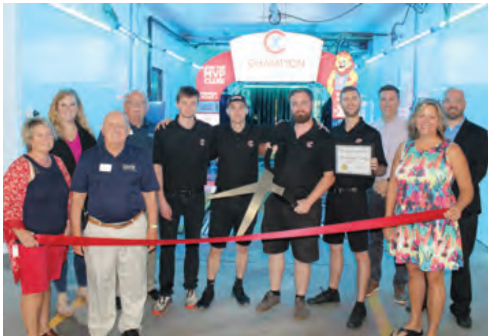
The Chamber Ambassadors held a ribbon cutting on June 24, 2022 to celebrate the grand opening of the Champion Xpress Carwash . It is located at 2401 S. Center Street.