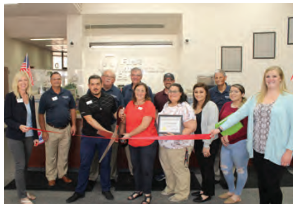
On June 28, 2022 the Chamber Ambassadors held a ribbon cutting to celebrate the transition to First Interstate Bank at the downtown location on 1st Avenue.

Visit www.marshalltown.org for all the latest Chamber news and upcoming events.