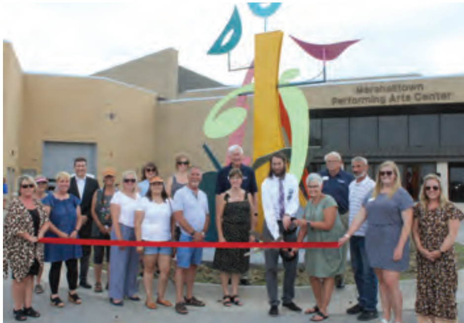
On June 30, 2022 the Chamber Ambassadors helped celebrate the new Scherzo sculpture with a ribbon cutting.