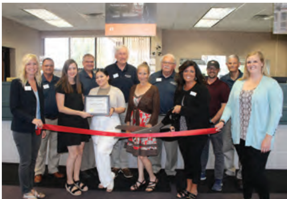
On June 28, 2022 the Chamber Ambassadors held a ribbon cutting to celebrate the transition to First Interstate Bank at the Southridge Road location.