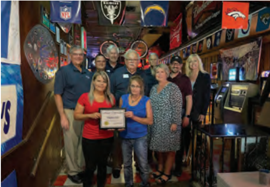
The Chamber Ambassadors did a courtesy call visit at Vaughn's Pub on June 28, 2022.