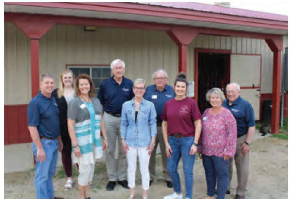
The Chamber Ambassadors visited Wolfe Ranch of Quakerdale on May 10, 2022 for a courtesy call stop.

Visit www.marshalltown.org for all the latest Chamber news and upcoming events.