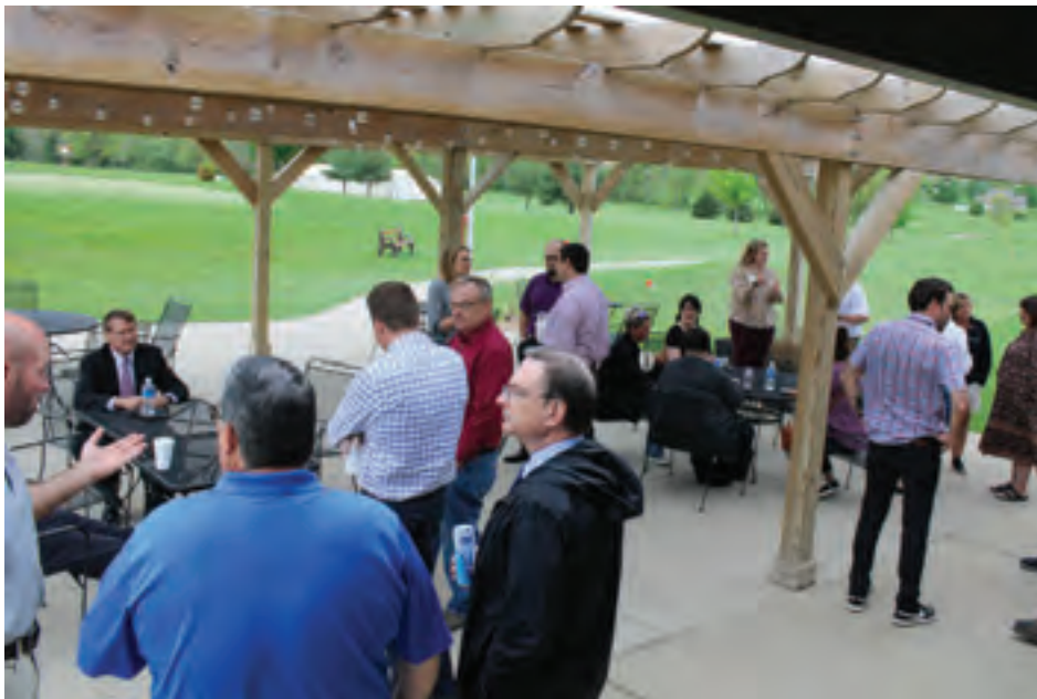
Wandering Creek Golf Course hosted Business After Hours on May 17.

The MEBS is administered locally by the Historical Society of Marshall County : 503 West Main Street; Marshalltown, IA 50158. Group tours of the MEBS in Haverhill are welcome. Please schedule in advance with the HSMC by calling (641) 752-6664.