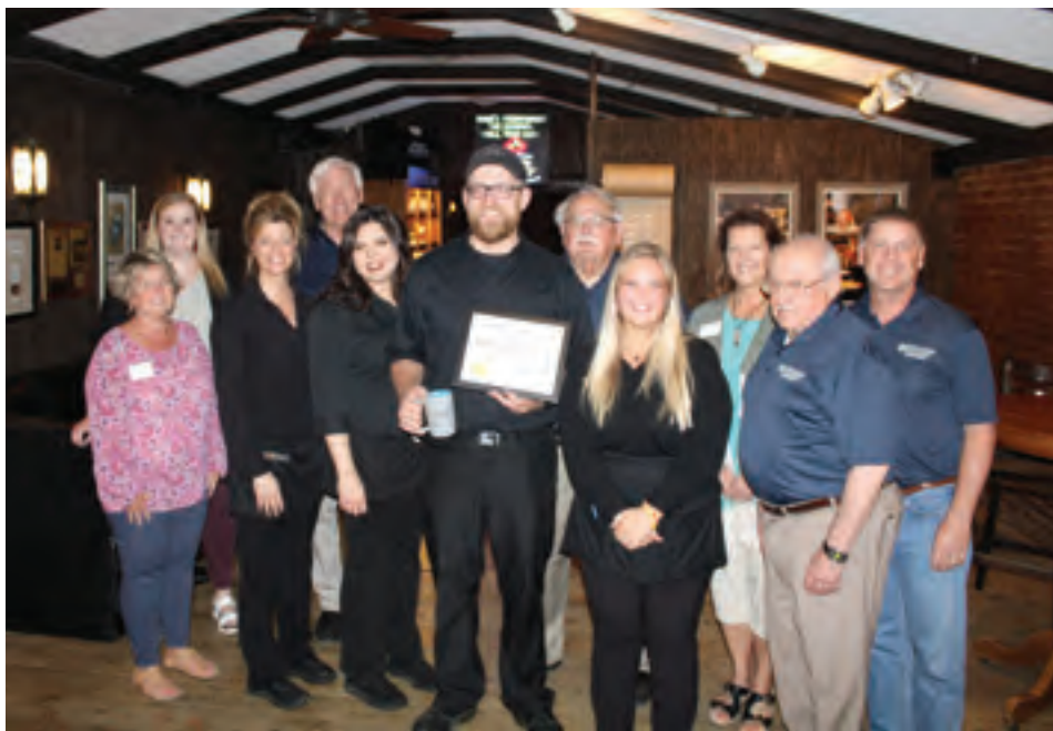
The Chamber Ambassadors made a courtesy call stop on May 10, 2022 at Rube's Steakhouse Montour .