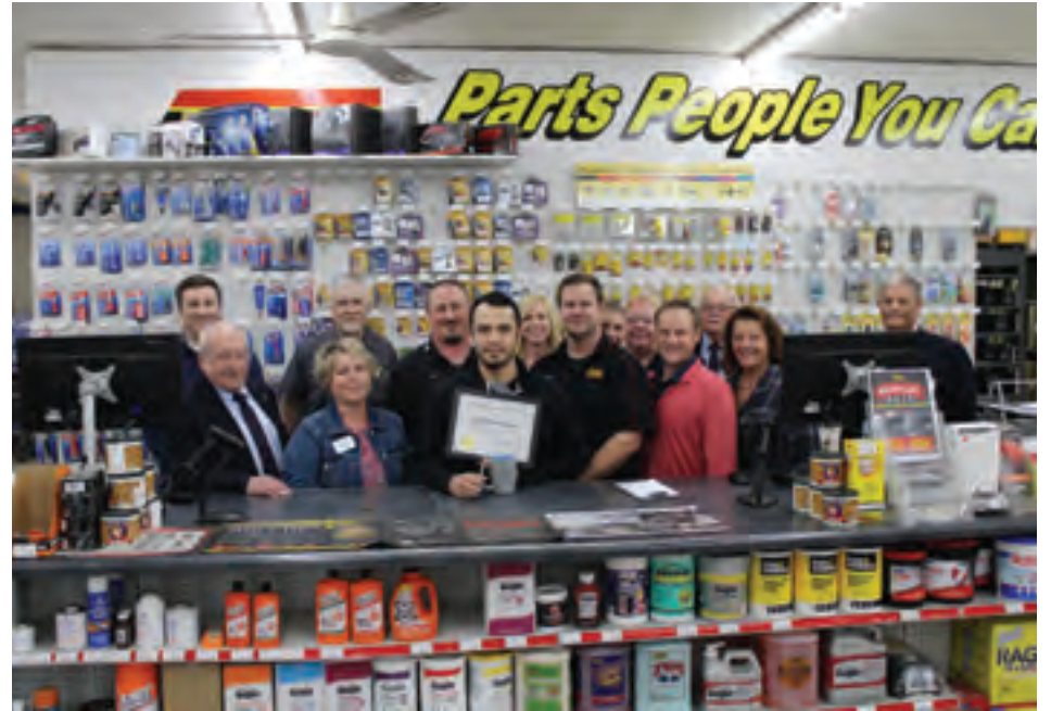
The Chamber Ambassadors made a courtesy call stop on April 26, 2022 to visit with the friendly staff at Arnold Motor Supply at 116 E. Anson Street in Marshalltown.