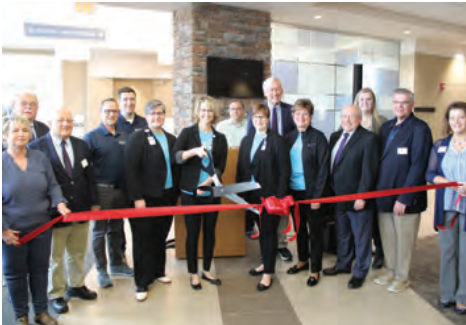
April 23, 2022 was an exciting day for Marshalltown as we cut the ribbon and toured the new UnityPoint Health - Marshalltown .