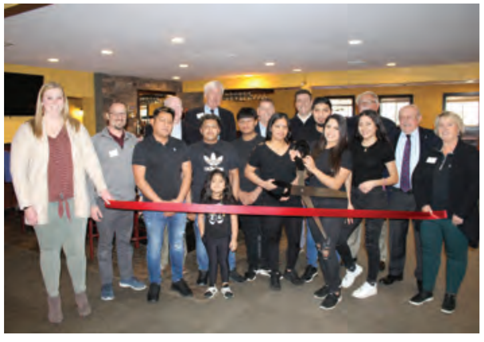
The Chamber Ambassadors held a ribbon cutting on March 29, 2022 for El Cantarito Bar and Grill, located at 903 W. Lincoln Way.

Visit www.marshalltown.org for all the latest Chamber news and upcoming events.