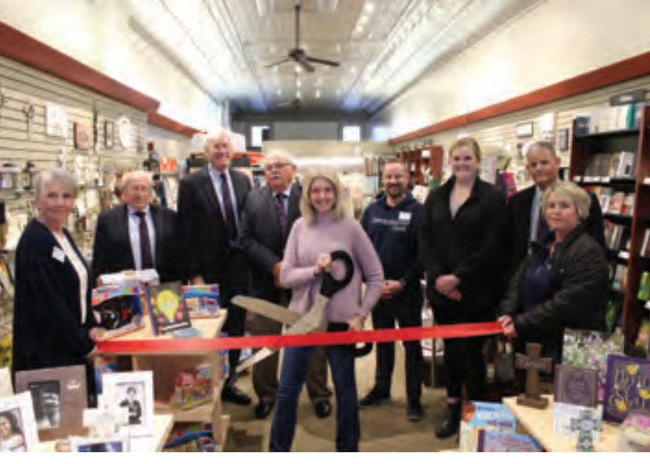
The Chamber Ambassadors held a ribbon cutting to help Stepping Stones Christian Bookstore celebrate 12 years in business on Main Street in Marshalltown on March 22, 2022.