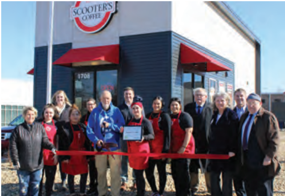
The Chamber Ambassadors held a ribbon cutting at Scooter's Coffee on February 18, 2022. Scooter's is located at 1708 S. Center Street.