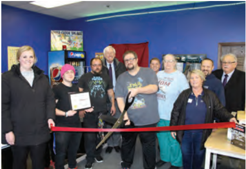
The Chamber Ambassadors helped celebrate the opening of Game Haven in the Marshalltown Mall with a ribbon cutting on February 22, 2022.