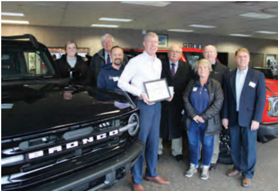
The Chamber Ambassadors made a courtesy call stop at Jensen Ford-Lincoln on February 22, 2022.