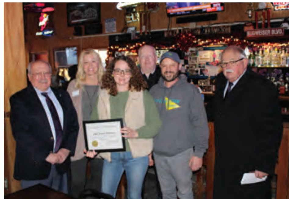
The Chamber stopped for a courtesy call at the Old Timer Tavern at 401 S. Center St. on January 25, 2022.