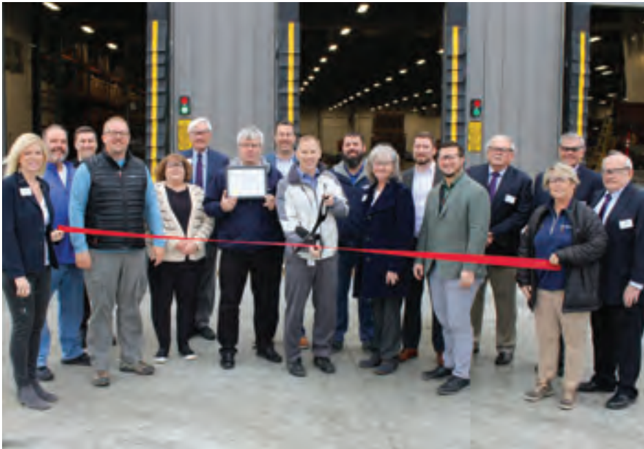
The Chamber Ambassadors held a ribbon cutting for the new addition at MARSHALLTOWN on February 11, 2022.