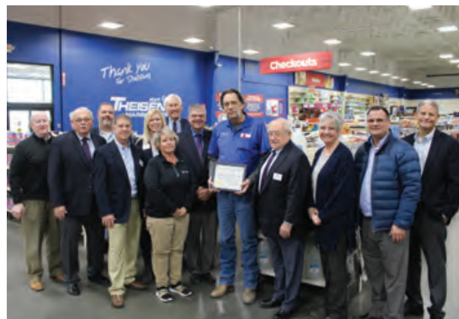
Theisen's Home-Farm-Auto was the location of courtesy call stop by the Chamber Ambassadors on February 8, 2022. Theisen's is located at 602 Iowa Ave. W.

Visit www.marshalltown.org for all the latest Chamber news and upcoming events.