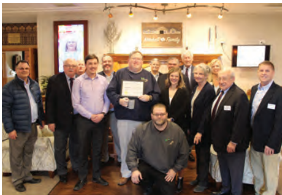
The Chamber Ambassadors made a courtesy call stop at Mitchell Family Funeral Home , 1209 Iowa Ave. W. on February 8, 2022.