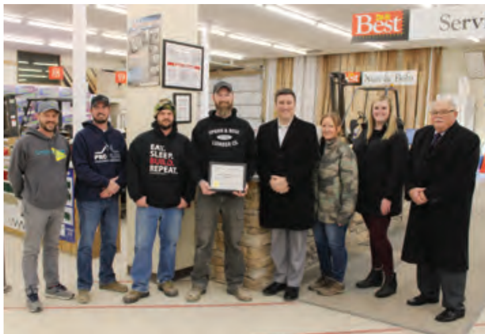
The Chamber Ambassadors stopped at Spahn & Rose Lumber Company at 110 W. Madison St. for a courtesy call on January 25, 2022.