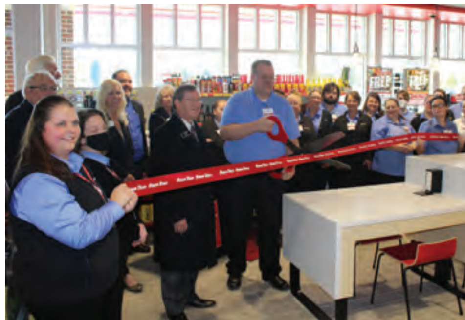
The Chamber Ambassadors were on hand for the ribbon cutting celebration of the new Kwik Star at 814 S. 6th St. in Marshalltown on November 2.