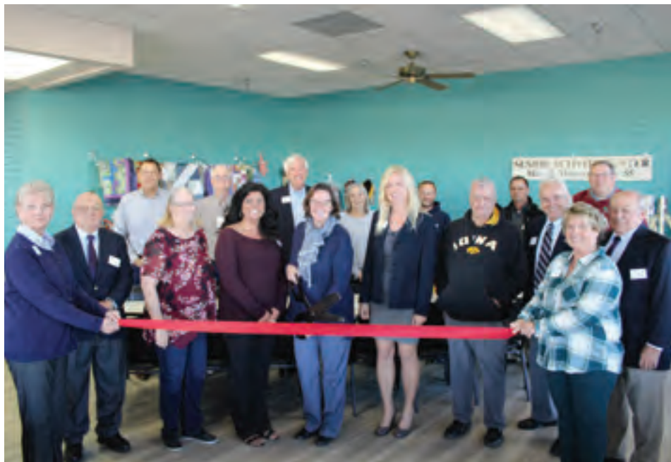
The Chamber Ambassadors held a ribbon cutting at the new location of the Marshalltown Senior Citizens Center on October 26. A beautiful renovation at 207 E. Church Street and awesome for our community.