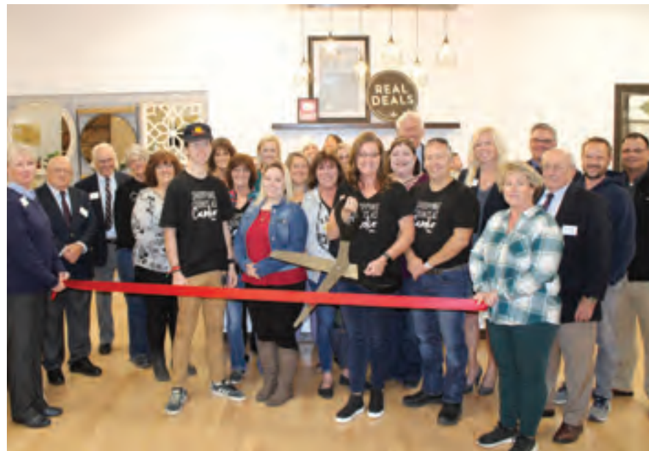
The Chamber Ambassadors held a ribbon cutting on October 26 at Real Deals-Marshalltown located at 122 E. Main Street. What a great addition to Marshalltown and welcome to the Chamber!