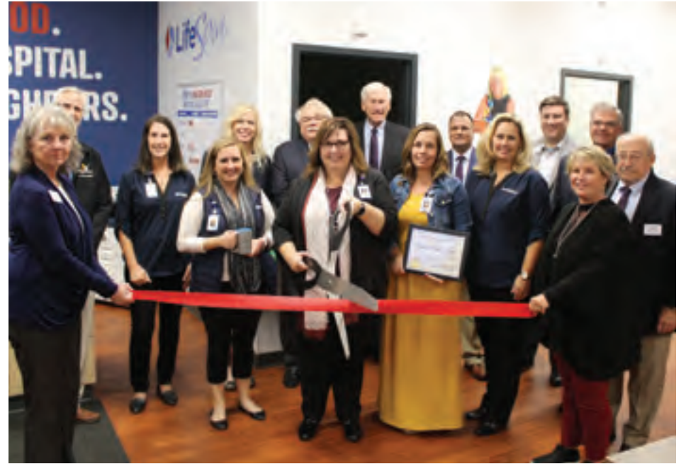
The Chamber Ambassadors held a ribbon cutting on November 9 at the expanded Marshalltown location of LifeServe Blood Center . It is located at 3109 S. Center Street.