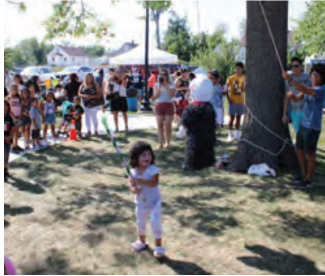
The Marshall County Arts & Culture Alliance hosted a Cultural Fiesta on September 19, 2021 at West End Park. The event featured dancing, music, food and other events. Pictured is the band Los de la Villa performing and a youngster taking a swing at a piñata.