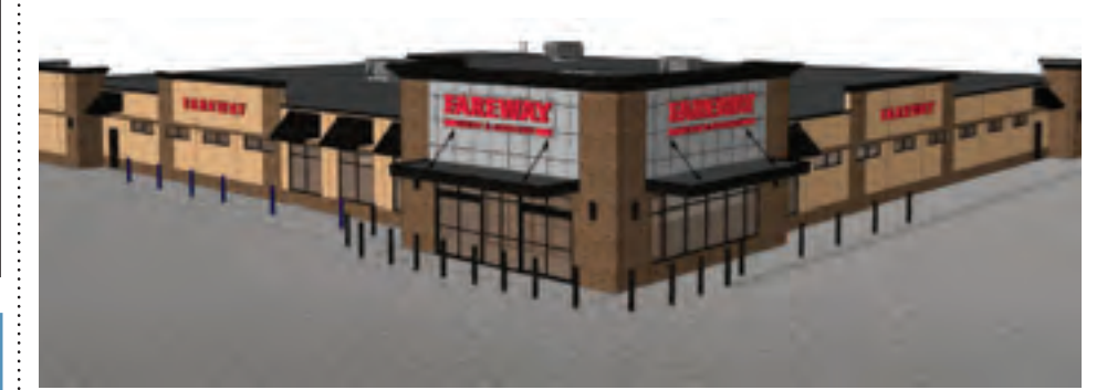
Rendering of the new Marshalltown Fareway

Fareway in Marshalltown has approximately 115 employees, many of which are long-term employees whom have 20 years of experience. The grand opening of the brand-new Marshalltown Fareway will be on Monday, August 16. At Fareway they take pride in supporting local communities and look forward to serving you and your family for many years to come!