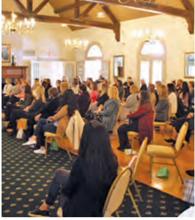
Women in Business 2021

DERMIT NO. 42 Marshalltown, IA 50158 MARSHALLTOWN, IA P.O. Box 1000 U.S. POSTAGE Marshalltown Area Chamber of Commerce Pre Sort Standard