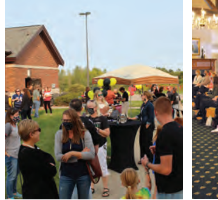
Business After Hours 2020

We hope to see you back at a Chamber event in the future as we connect as a community again face-to-face. Get the most of your Chamber membership by making those lasting connections in the community.