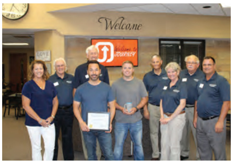
The Chamber Ambassadors made a courtesy call visit to Journey Church (700 E. Olive St.) on June 22, 2021.