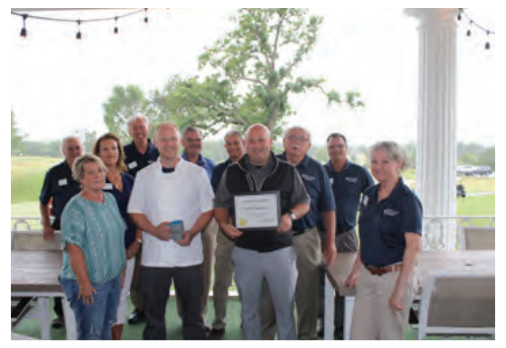
The Chamber Ambassadors made a stop at Elmwood Country Club (1734 Country Club Ln) for a courtesy call on June 22, 2021.