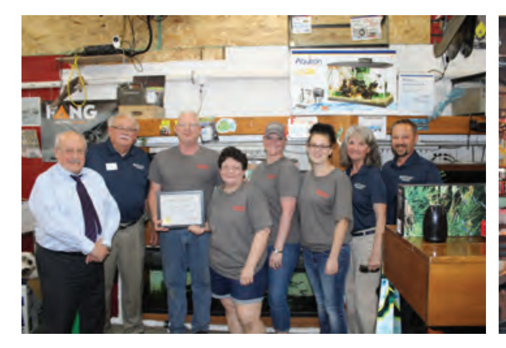
On July 15, 2021 the Chamber Ambassadors made a courtesy call visit to Fire House Aquatics (2945 Taylor Ave, Gilman).

The Chamber Ambassadors made a courtesy call stop at Haverhill Social Club (210 1st St, Haverhill) on July 15, 2021.