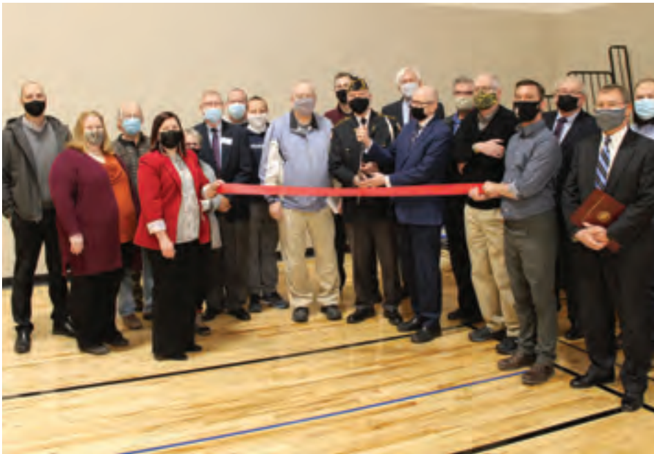
The Chamber Ambassadors held a ribbon cutting at the dedication ceremony of the newly-renovated Veterans Memorial Coliseum on March 15, 2021.