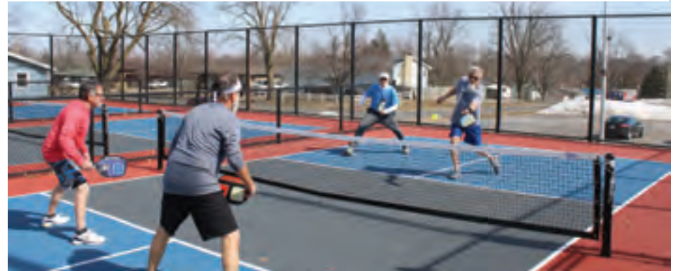
Pickleball at the new Marshalltown Court Complex at Marshalltown High School

business.marshalltown.org/community-events