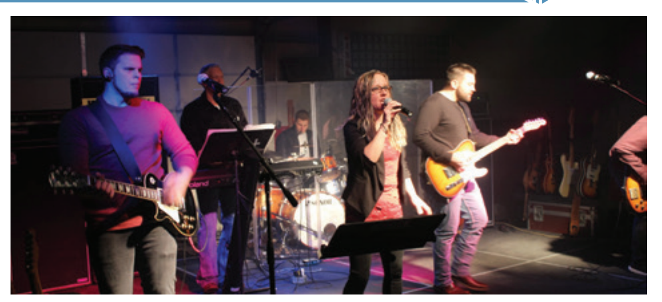
Local band Grand Marshall is pictured during a night of live music at the Central Iowa Fairgrounds on February 13. The fairgrounds will also host live music shows on March 20 and April 10. For more information see the events calendars on the Chamber website at www.marshalltown.org.