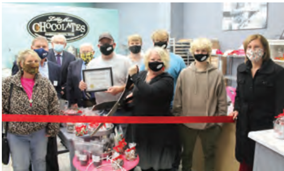
The Chamber Ambassadors held a ribbon cutting at Lillie Mae Chocolates at 217 N. 13th St. on November 24.