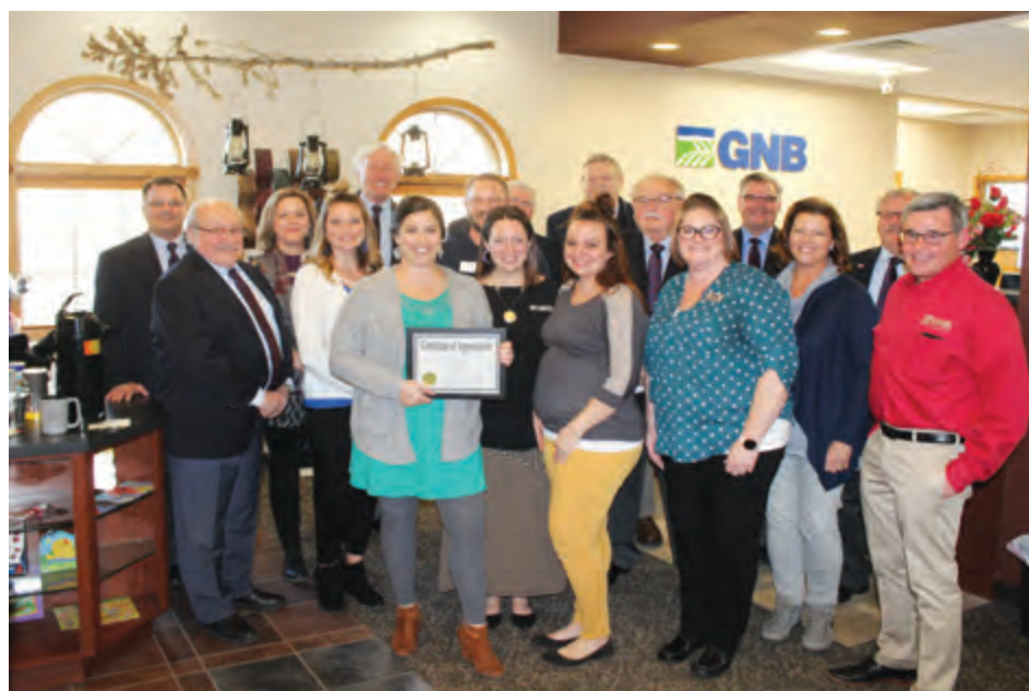
On February 11, 2020 the Chamber Ambassadors held a Courtesy Call at GNB Bank and Insurance located at 2504 S. 2nd Street in Marshalltown thanking them for their continued service to the community!

Visit www.marshalltown.org for all the latest Chamber news and upcoming events.