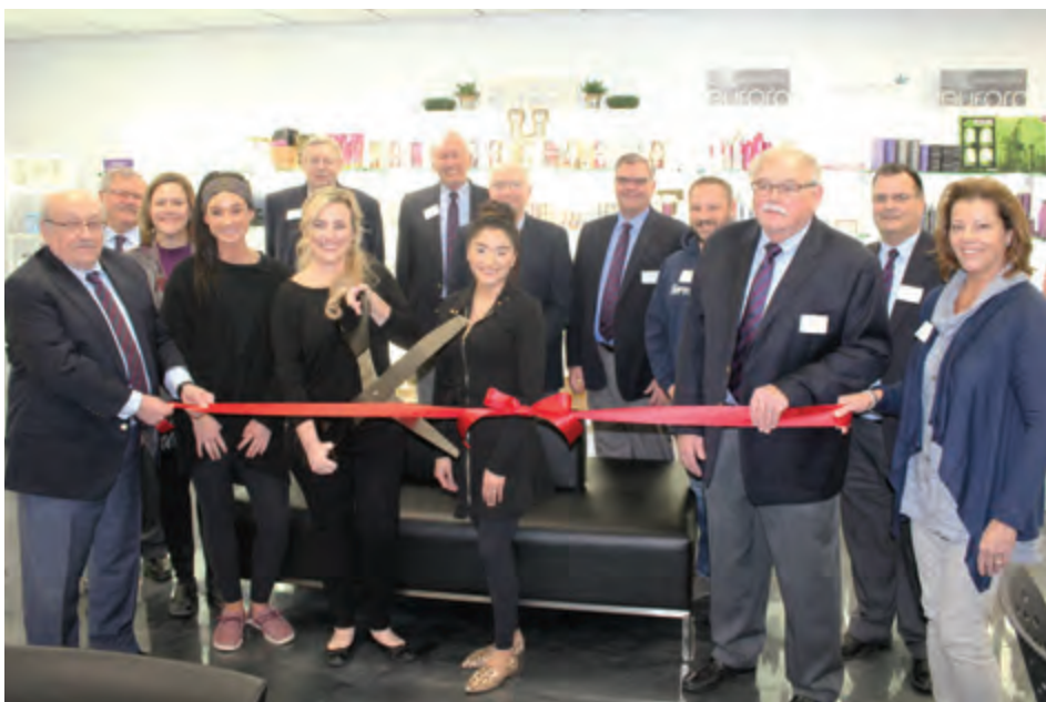
On February 11, 2020 the Chamber Ambassadors held a ribbon cutting at ASPArations located at 112 Nicholas Drive in Marshalltown welcoming this salon and spa to their new location!