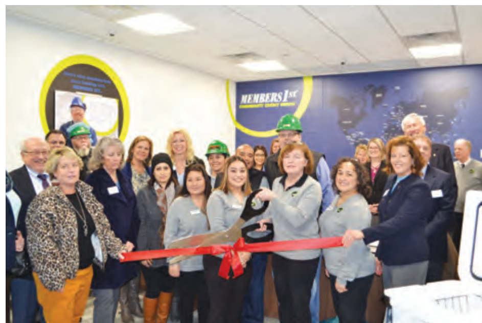
On January 28, 2020 the Chamber Ambassadors held a ribbon cutting at the JBS location welcoming Member 1st Credit Union to the area!