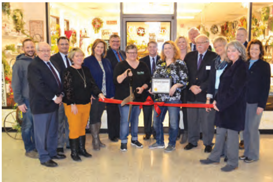
On January 28, 2020 the Chamber Ambassadors held a ribbon cutting at the Oliver Beene Designs in Meadow Lane mall located at 1714 S. Center St, Marshalltown.