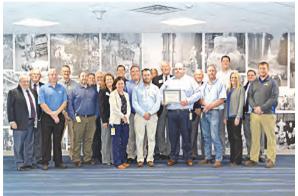
On October 22, Chamber Ambassadors held a courtesy call at the Fisher Governor Road Operations (1702 S 12th Ave).