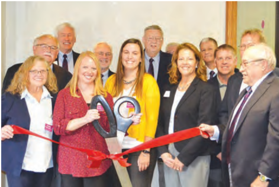
A ribbon cutting for the Northeast Iowa Area Agency on Aging (123 W. Main St.) was held on October 22.