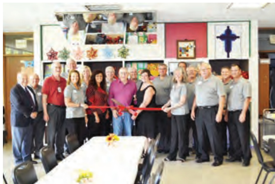
A ribbon cutting for the Marshalltown Senior Citizens Center was held at their new location (709 S Center St.) on August 27.