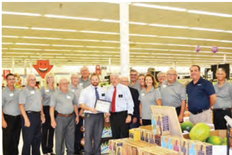
Chamber Ambassadors hosted a courtesy call with staff of Hy-Vee (802 S Center St.) on August 27.