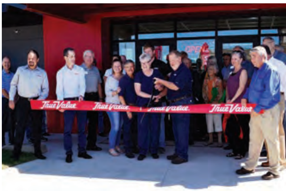
On September 6, Chamber Ambassadors, staff, and family gather at Thompson True Value Hardware (106 S Center St.) for a ribbon cutting at their new store.