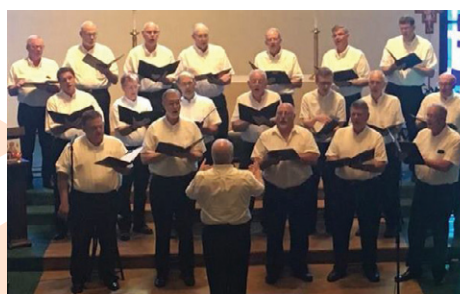
Marshalltown Men's Chorus

• Saturday, April 13: The Marshalltown Men's Chorus will present their 64th Annual Concert, "American Bandstand Reverie!" featuring music of the 1950s and 1960s. Held at the Marshalltown High School/Community Auditorium (1602 South 2nd Avenue), the concert will begin at 6:30 p.m. For ticket information, call 641-753-7275.