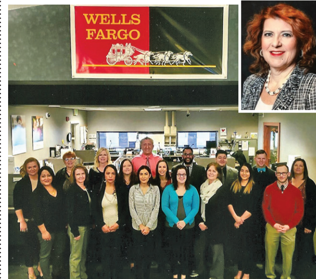
Above: Wells Fargo Marshalltown staff.