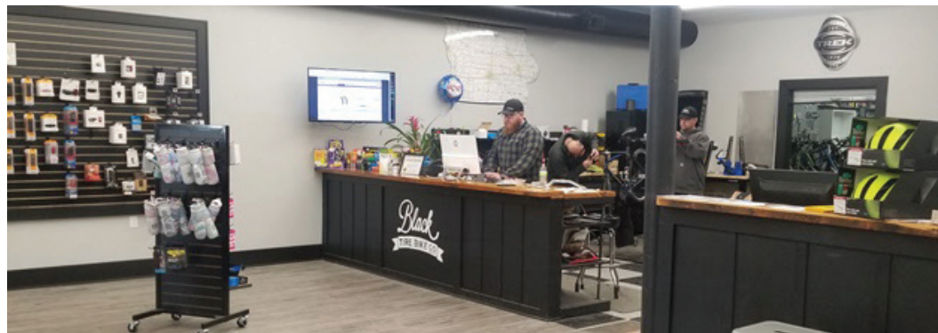
The new customer service desk at Black Tire Bike Company, a loan recipient.

The loans are made possible through the partnership of Consumers Energy Cooperative, Heart of Iowa Communications Cooperative, and Marshall Economic Development (MED). The funds being used are part