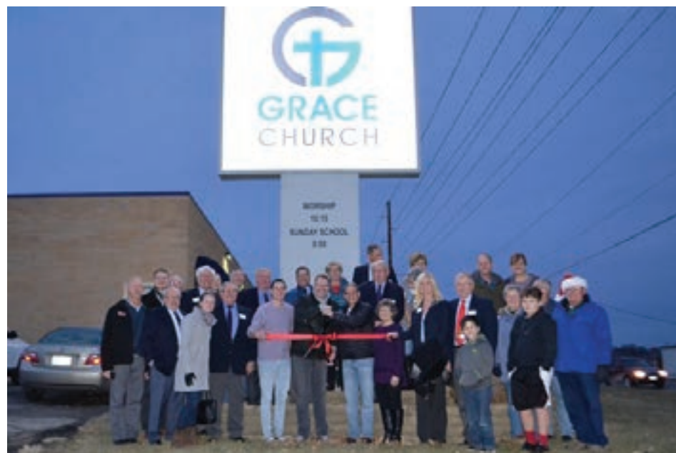
Chamber Ambassadors with the staff and members of Grace Church (3111 South 6th Street--formerly Evangelical Free Church) cut the ribbon on December 11, celebrating the re-branding and new church name.