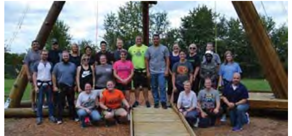
The Iowa Valley Leadership class of 2019 as they prepare to climb the Iowa Valley Challenge Course.