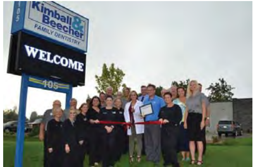
Chamber Ambassadors and the staff of Kimball & Beecher Family Dentistry celebrated the opening of the new facility (105 West Merle Hibbs Blvd.) with a ribbon cutting on August 28.