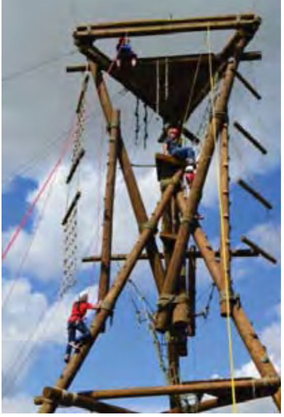
The Iowa Valley Leadership class begins with a team-building retreat that includes the Iowa Valley Challenge Course.

leaders, as well as visit or experience numerous businesses and organizations in order to learn more about the community, its current needs, and opportunities.