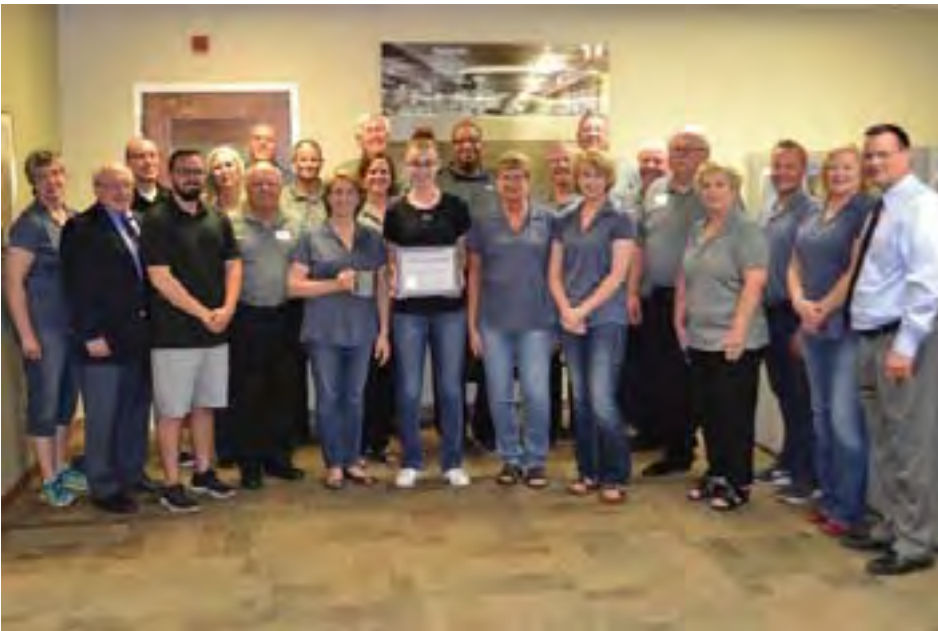
The management and staff of Packaging Corporation of America (1402 South 17th Avenue) visited with Chamber Ambassadors during a May 8 courtesy call.