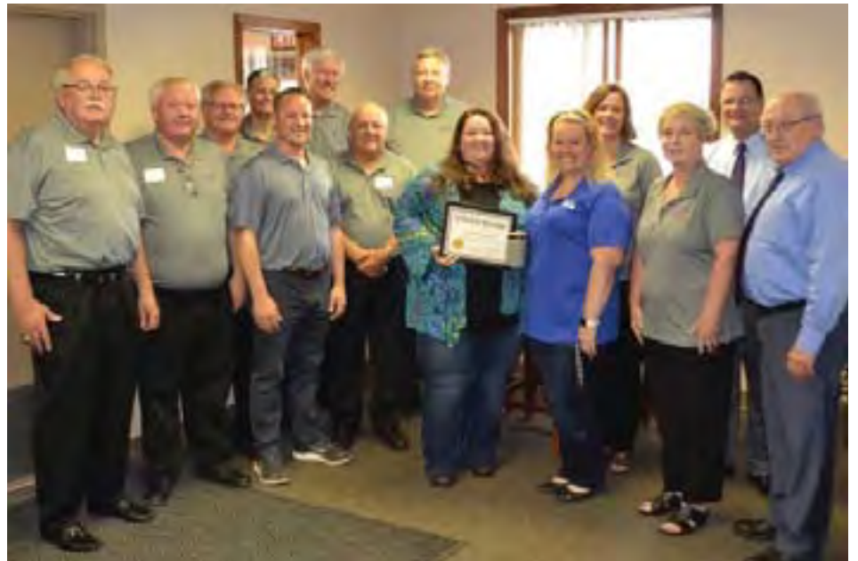
On May 8, Chamber Ambassadors learned about the operations of Scott Manufacturing (1702 East Anson) during a courtesy call with the company's staff.

Visit www.marshalltown.org for all the latest Chamber news and upcoming events.