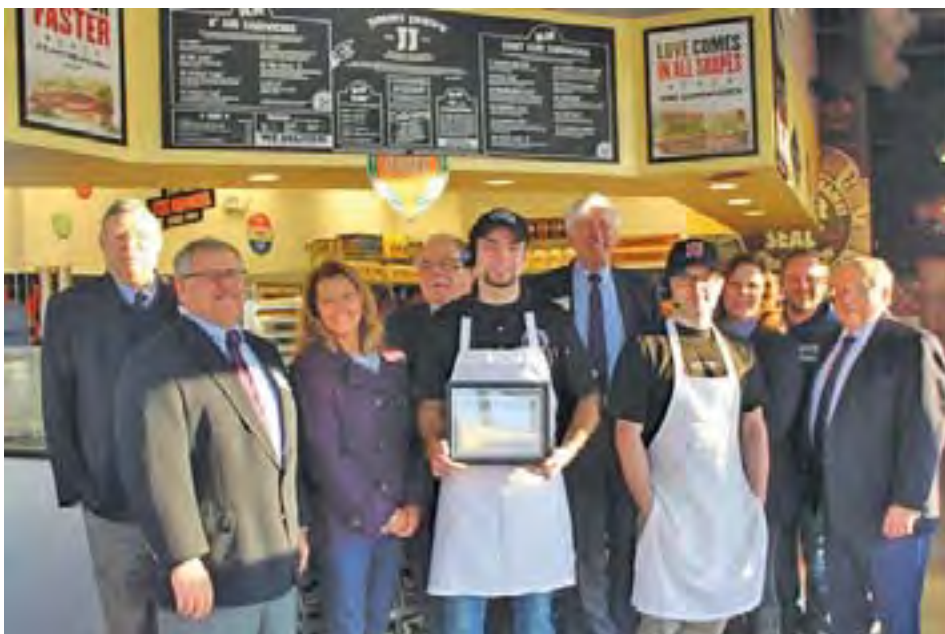
On February 13, Chamber Ambassadors hosted a courtesy call with the staff of Jimmy John's (1702 South Center Street).