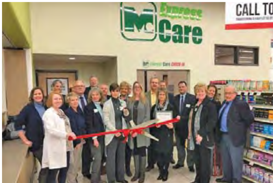
McFarland Clinic staff and Chamber Ambassadors celebrated the opening of the new McFarland Express Care location inside Hy-Vee (802 South Center Street) with a ribbon cutting on January 23.