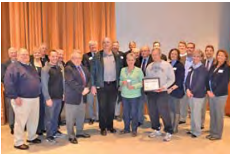
Left: On March 13, Chamber Ambassadors received an update from members of the Marshalltown Community Theatre (709 South Center Street) during a courtesy call.