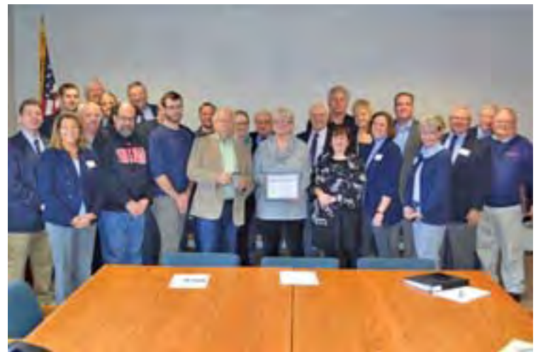
Right: Board members of Central Iowa Art Association (709 South Center Street) were greeted by Chamber Ambassadors during a courtesy call on March 13.

Visit www.marshalltown.org for all the latest Chamber news and upcoming events.