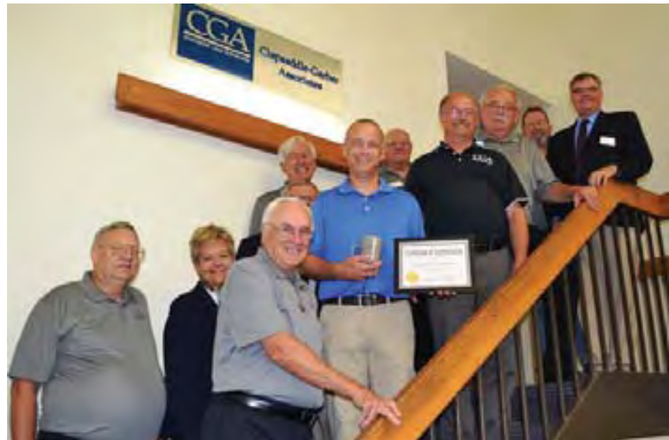
Chamber Ambassadors hosted a courtesy call with the staff of Clapsaddle-Garber Associates, Inc. (16 East Main Street) on September 26.