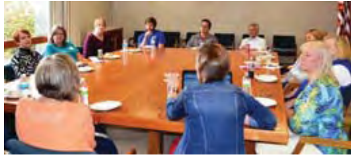
Chamber round table discussion

Polling place voting takes place November 7; early voting is available now at the Auditor's office in the Marshall County Courthouse.