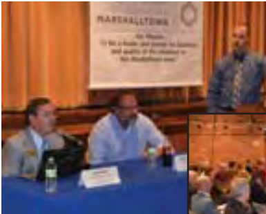
Chamber Forum for City Office Candidates

The Chamber recently sponsored a forum of those running for city office. Chamber members and the community had a chance to hear the views of the ten candidates who are on the ballot for either Mayoral or City Council positions.