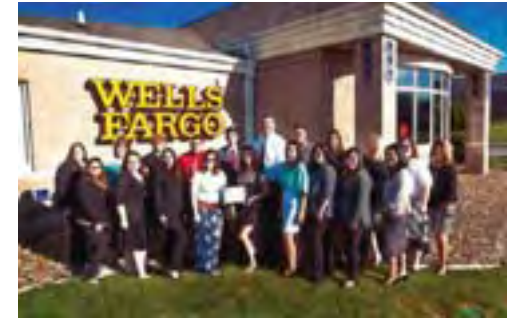
The Marshalltown Wells Fargo Bank team

Wells Fargo provides banking, insurance, investments, mortgage, and consumer and commercial financial services through more than 8,500 locations worldwide. They are also invested in the communities where they are located. For instance in 2016, they contributed $281.3 million to more than 14,900 non-profits. Beyond that, their employees are personally committed to the communities they serve.