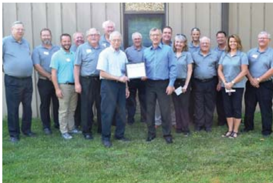
On September 12, Chamber Ambassadors hosted a courtesy call with the staff of Mid-Iowa Workshop (909 South 14th Avenue) to celebrate the organization's 50th anniversary.