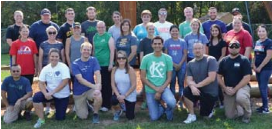
Members of the Iowa Valley Leadership Class of 2018 took on the Iowa Valley Challenge Course during their kick-off retreat.