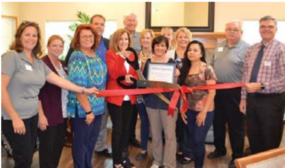
Chamber Ambassadors and the staff of Glenwood Place Retirement Community (2907 South 6th Street) celebrated the opening of their new addition with a ribbon cutting on September 14.