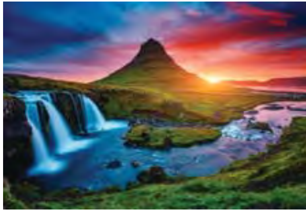
The Iceland trip leaves September 19, 2018.

Learn about the two Experience Trips being offered by the Chamber in 2018 during informational sessions on Wednesday, August 30 at noon and again at 5:30 p.m., as well as on Thursday, August 31 at 8:00 a.m. Destinations are a domestic tour of the Pacific Coast in