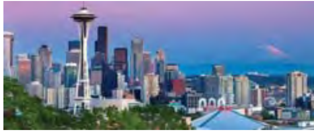
The Pacific Coast tour will depart June 14, 2018.

June and an international excursion to Iceland in October. Each meeting will cover both trips and will be held at Fisher Community Center (709 South Center St.)