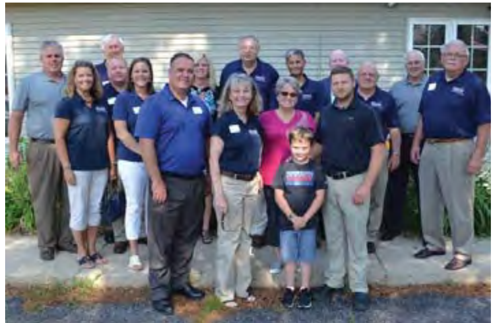
Chamber Ambassadors and the doctors and staff of Marshalltown Oral Surgeons, PC, celebrate the grand opening of the new office, located at 113 Nicholas Drive, with a ribbon cutting on July 25.