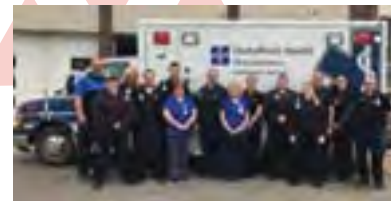
Marshalltown's EMS crew

UnityPoint Health – Marshalltown EMS crew, Marshall County First Responders, and the entire Marshall County EMS System for receiving the American Heart Association's 2016 Mission: Life-line Silver Award. This award is given to EMS programs that meet or exceed the national benchmarks in regard to pre-hospital care of those who have heart attacks.