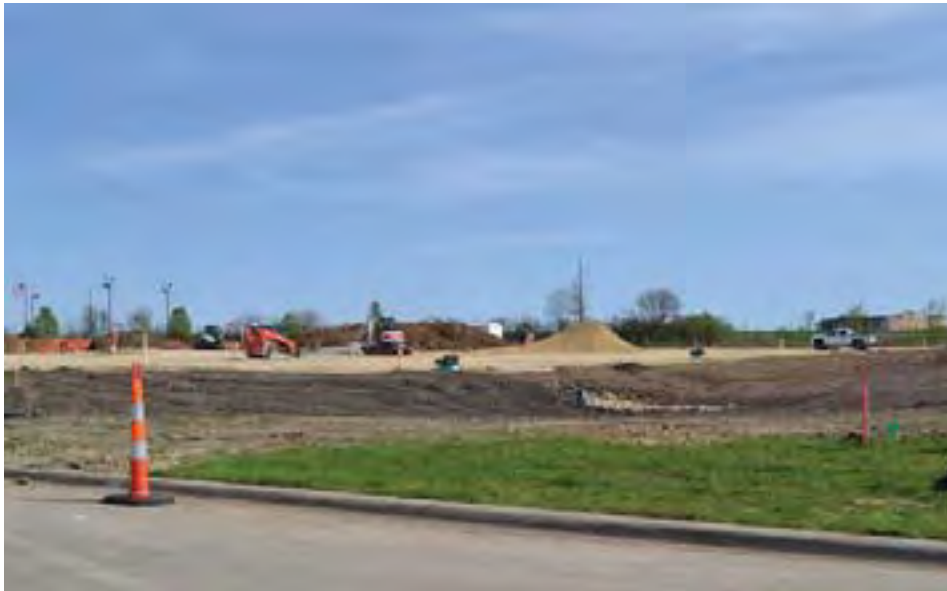
Work progresses after the groundbreaking for Holiday Inn Express.

Marshall Economic Development (MED) is pleased to see groundbreaking on the Hawkeye Hotel Group's new Holiday Inn Express along the Iowa Avenue commercial corridor. MED staff began working with Hawkeye in the summer of 2016. The new facility will feature 93 units employing up to 40 full- and part-time positions. The community has seen interest from multiple developers over the past six years. Hawkeye estimates an overall economic impact of $200 million through new taxes, job creation, and consumer spending of visitors. Hawkeye owns and operates 50 hotels across the United States with more than 1,000 employees.