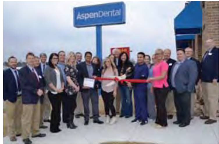
Right: Chamber Ambassadors and the staff of Aspen Dental (2615 South Center Street) celebrated the opening of the Marshalltown location with a ribbon cutting on February 28.