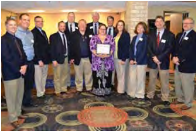
Left: On February 28, Chamber Ambassadors hosted a courtesy call with Baymont Inn & Suites (115 Iowa Avenue West) and viewed the hotel's most recent updates.