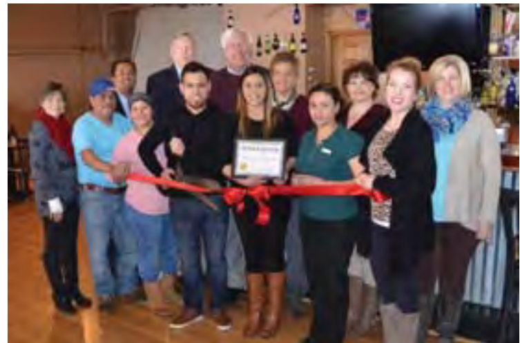
Right: Chamber Ambassadors and the staff of Mi Ranchito Mexican Grill and Seafood (1010 West Lincolnway) celebrated the restaurant's opening with a ribbon cutting March 15.

Visit www.marshalltown.org for all the latest Chamber news and upcoming events.