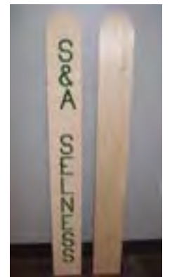
Pickets available for sponsorship.

The class is also selling pickets to complete a picket fence around the MEGA-10 garden area. Pickets are available for $100 each and can include up to 11 characters. For more information about Iowa Valley Leadership, visit: www.marshalltown.org/work/iowa-valley-leadership/ .