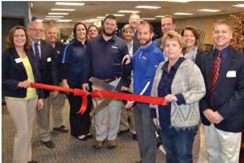
On January 24, the manager and staff of Aaron's (2901 South Center Street) along with Chamber Ambassadors celebrate the opening of the store's new location with a ribbon cutting.